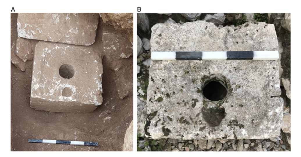
Figure 2. Stone toilet seats from Armon ha-Natziv (A, left) and House of Ahiel (B, right).