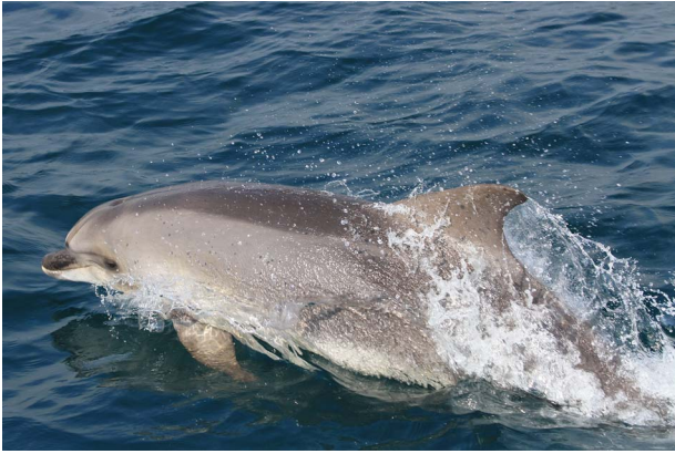
Endangered Black Sea bottlenose dolphin Tursiops truncatus ponticus in an Important Marine Mammal Area in the war zone in the Black Sea.

used in spatial planning in Malaysia, to create marine protected areas in Bangladesh and Viet Nam, by the United States Navy to avoid using low-frequency sonar in cetacean habitat, to establish International Maritime Organization Particularly Sensitive Sea Areas in the Mediterranean where fin and sperm whales are struck by ships, and by shipping companies transiting the Indian Ocean for route planning to reduce the risk of hitting whales. In total, the freely available IMMA package of shapefiles has been downloaded over 725 times from the IMMA website ( marinemammalhabitat.org/imma-eatlas ).