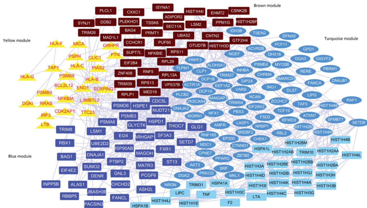
Fig. 1 Co-expression module containing genes in protein-protein interaction.

The cumulative evidence of rare or common variants for all genes in each module was evaluated in patients with schizophrenia and controls. Using the whole-exome sequencing data, we found that the combining effect rare variants of genes in the yellow module were significantly associated with schizophrenia ( P = 0.002, P_{\text{adjusted}} = 0.008 ). Furthermore, we found that the same combining effect in the yellow module was also associated with reduced fractional anisotropy in the left anterior cingulate cortex ( P = 0.006, P_{\text{adjusted}} = 0.024 ) and with reduced overall fractional anisotropy ( P = 0.041 , uncorrected) only in patients with schizophrenia, not in the controls (Table 3). However, no significant association between common variants of genes in each module and the overall fractional anisotropy was detected.