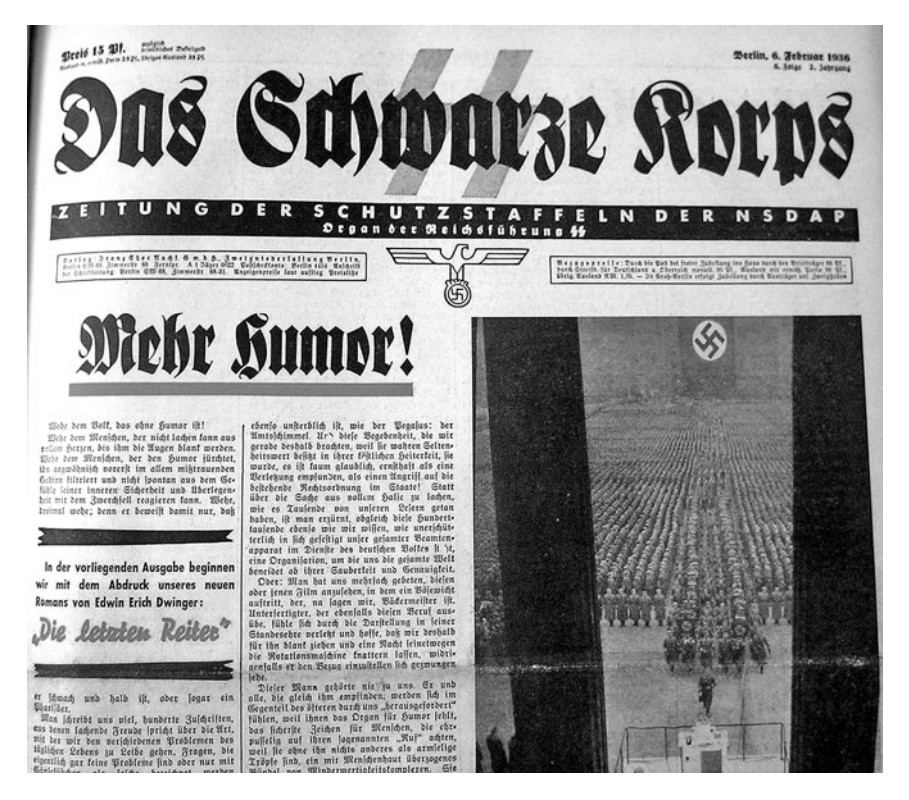
Figure 2. The complaints of the public about satires and the reaction of Schwarze Korps "More Humour!" Anonymous, "Mehr Humor!",

Das Schwarze Korps, 2 (6) (1936), p. 1. Copyright: Arbeitsstelle für Kommunikationsgeschichte und interkulturelle Publizistik (AKIP), Freie Universität Berlin. Used with permission.