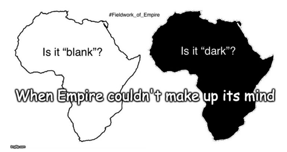
Figure 1. Adrian S. Wisnicki, "When Empire Couldn't Make Up Its Mind." Copyright Adrian S. Wisnicki: Creative Commons Attribution–NonCommercial 3.0 Unported (https://creativecommons.org/licenses/by-nc/3.0).

which my meme speaks. The maps also hint at the means by which local cultural and geographical knowledge—the basis of other earlier maps of Africa—came to be replaced by European knowledge in later maps.