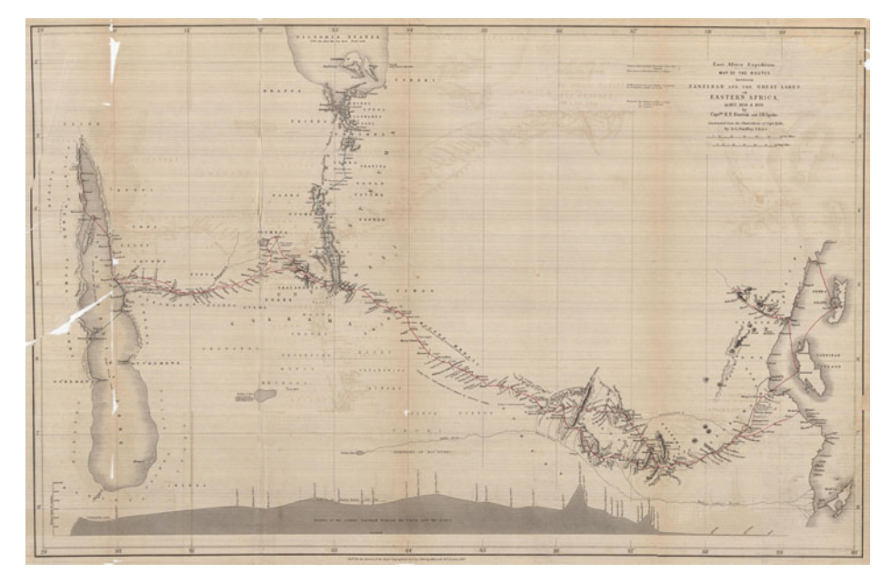
Figure 3. Alexander George Findlay and John Hanning Speke, "East African Expedition. Map of the Routes between Zanzibar and the Great Lakes in Eastern Africa in 1857, 1858 & 1859. by Captus R. F. Burton and J. H. Speke." Public domain.

often drew on oral knowledge gained from local trade and trading routes. Late nineteenth-century mapping practices thus depended on erasing and/or rewriting earlier knowledge. Figure 5, for example, a map that appeared just a few years earlier than those of Burton and Speke (see above), shows a series of trading routes from the East African coast into the interior. The map also embeds longer segments of prose, in situ, to denote other geographical data provided by informants. Such nineteenth-century maps, therefore, offer a window onto how local African and Arab knowledge circulated via trade and so could be collected and assembled by Europeans in the first place.