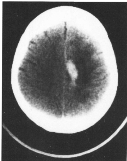
Figure 2 — This cranial CT scan reveals the second hemorrhage, involving the area adjacent to the inter-hemispheric fissure on the left side.

Carotid endarterectomy was done without complications. Post-operative examination showed no new deficits. One and a half hours later the patient developed a right hemiplegia and aphasia. Blood pressure was monitored during this period and had remained normal. Immediate return to surgery showed the carotid artery to be patent. Cranial CT scan done 24 hours later showed a hemorrhage in the left internal capsule and putamen region (see Figure 1). Gradual improvement in strength was followed by a second episode of weakness on the right side. Repeated CT scan showed a second hemorrhage in an area adjacent to the inter-hemispheric fissure, medial to the area of infarction (see Figure 2).