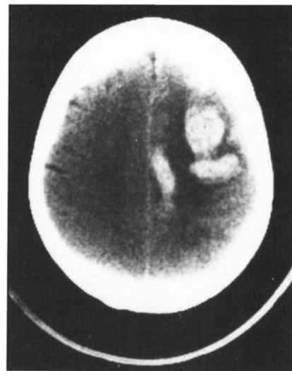
Figure 3 — Cranial CT scan after the third hemorrhage; this time the hemorrhage involves the area of the previous cerebral infarction.

Post-CEA hemorrhage is uncommon with an incidence of 0.4-0.6 percent, 2,15 and its etiology remains poorly understood.