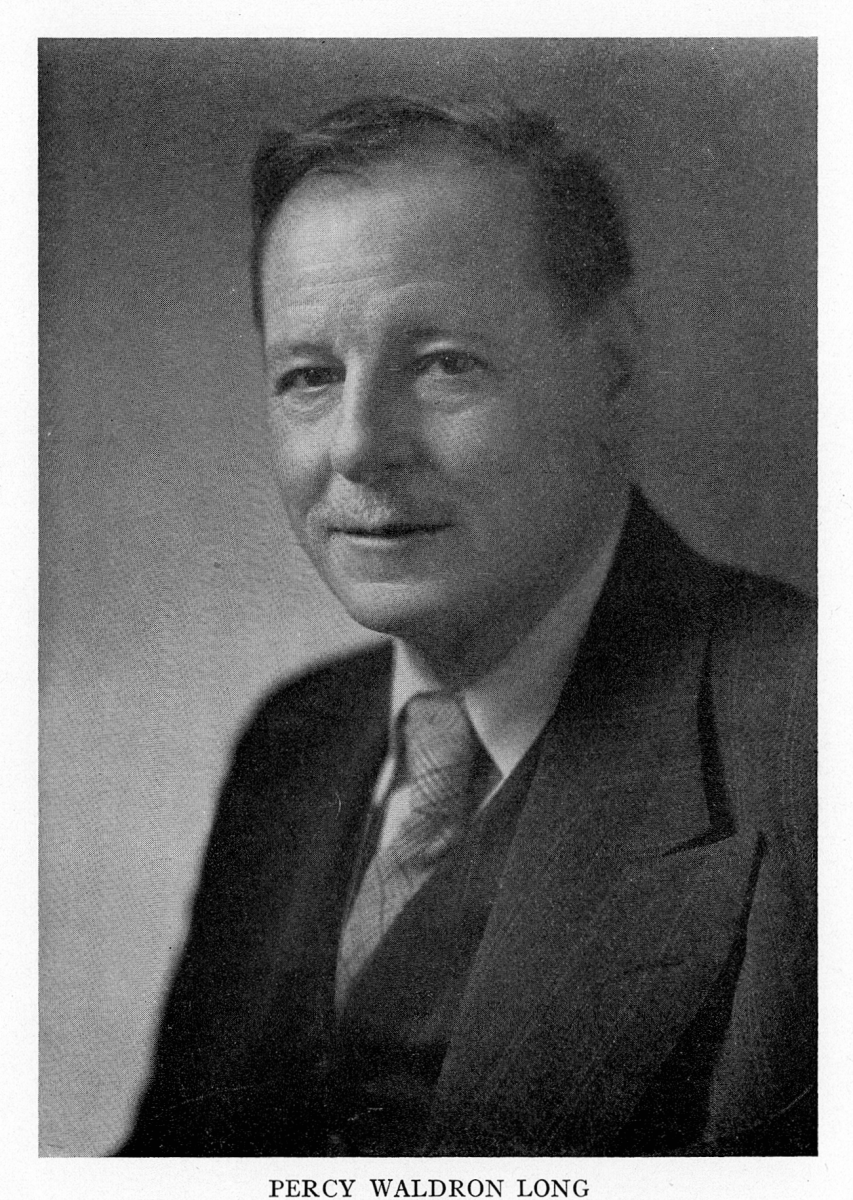
21 September 1876—2 October 1952 Secretary of the Association 1935–47 President 1948