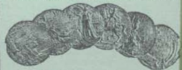
Gold Medal (Highest Award), Allahabad 1910.

Prepaid Annual Subscription, £1 (5 dollars) post free.