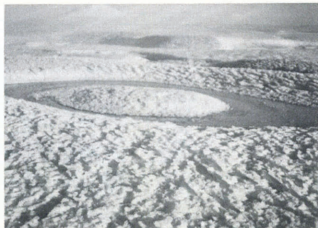
Fig. 1. Ice blister in a melt pool on the Koettlitz Glacier Ice Tongue (McMurdo Sound, Antarctica) surrounded by summer meltwater. The ice blister is about 12 m across and 0.5 m high.

In a recent letter to the Editor of Journal of Glaciology , Kovacs (1992a) gave a very comprehensive review of observations and morphology of ice blisters on glaciers, sea ice and rivers. Kovacs (1992a, b) gave many examples of ice blisters from Alaska and Antarctica, where they are generally observed in association with the ready availability of liquid water (Fig. 1). Ice blisters are usually 5–20 m across and 1–3 m high, although Echelmeyer and others (1991) estimated that some of the examples they observed on Jakobshavn Isbræ, West Greenland, were up to 8 m high. Kovacs (1992b) discussed their formation by the freezing of water trapped within ice which expands and forces up the ice cover, in an analogous way to the cream on top of a frozen bottle of milk. Many ice blisters are hollow inside with evidence for the release of water provided by the presence of refrozen water-icings around the ice blister. The drilling of many blisters reveals the presence of liquid water in their core.