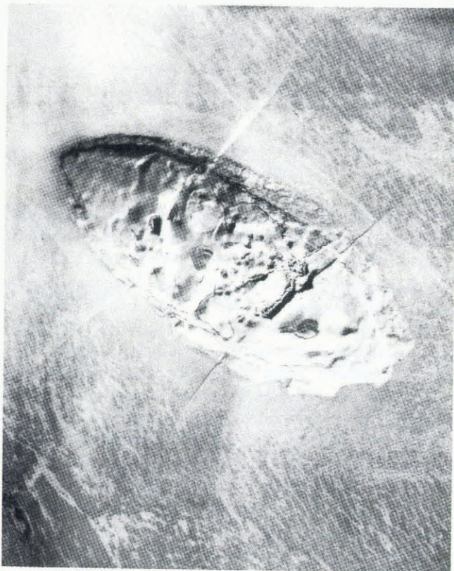
Fig. 3. Vertical air photograph of an ice doline at 71° 20' S, 68° 40' E near the southern edge of the Amery Ice Shelf, Antarctica. The doline is about 3 km long by 1.3 km wide and stereo-pair photography gives a depth for the doline of 80 m below the surrounding ice surface (Mellor and McKinnon, 1960).

(Reynolds, 1983). The area near the doline has very low net accumulation, being in the precipitation shadow of Alexander Island, and is also associated with many