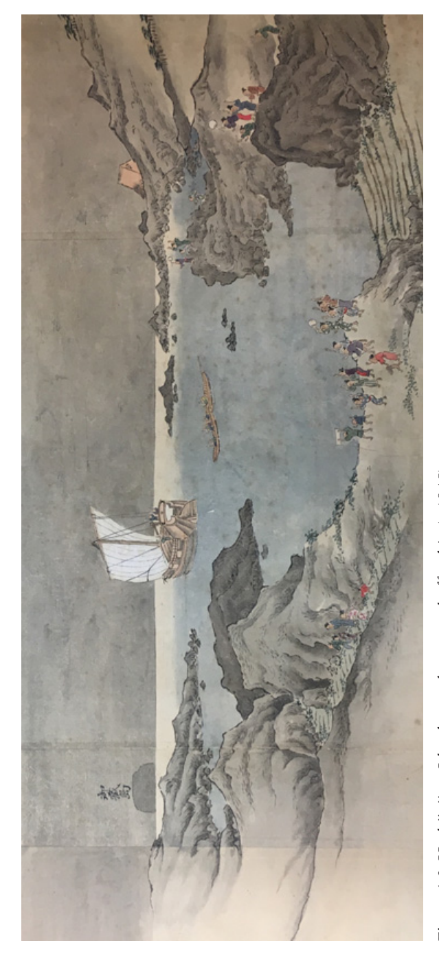
Figure 1.3 Hachijōjima Islanders gather to send off a ship (c.1845) Source: Shigeyama Takanobu, Izu Shichitō emaki (1845). Columbia University C. V. Starr collection