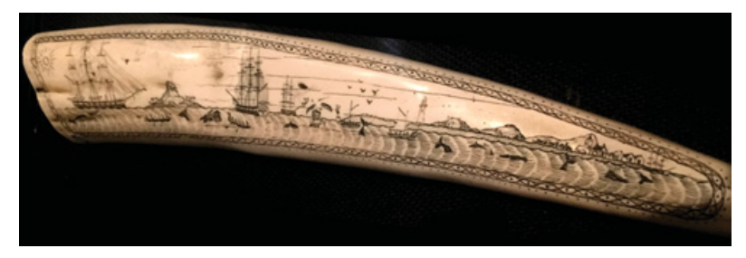
Figure 1.1 Scrimshaw etching of Arctic whaling expedition on walrus tusk (n.d.)

guano mining in important ways, most notably in its extreme mobility, its vulnerability to boom and bust cycles, and its lack of regard for any kind of sustainable resource management. Moreover it was, at the time, something fundamentally new. Japanese and Indigenous people throughout the Pacific have hunted whales for centuries but from around 1780, after whale sightings in the Atlantic became scarce, British, French and American whalers began venturing round Cape Horn into the Pacific.<sup>6</sup> This represented both a step-change in scale and a profound transformation in the way the industry was organised. The actual techniques used to hunt did not change much at first, but sending an expedition half-way around the world on a voyage involved raising substantial venture capital funds, outfitting a much larger vessel, and recruiting captains and crew who knew how to sail the open ocean. The end purpose of the expeditions was also quite different: while earlier hunters had generally made use of all parts of the whale, global whalers jettisoned most of the carcass and focused exclusively on extracting oil and baleen.8 The former was turned into lamp oil through a complex industrial process of 'pressing, fluxing