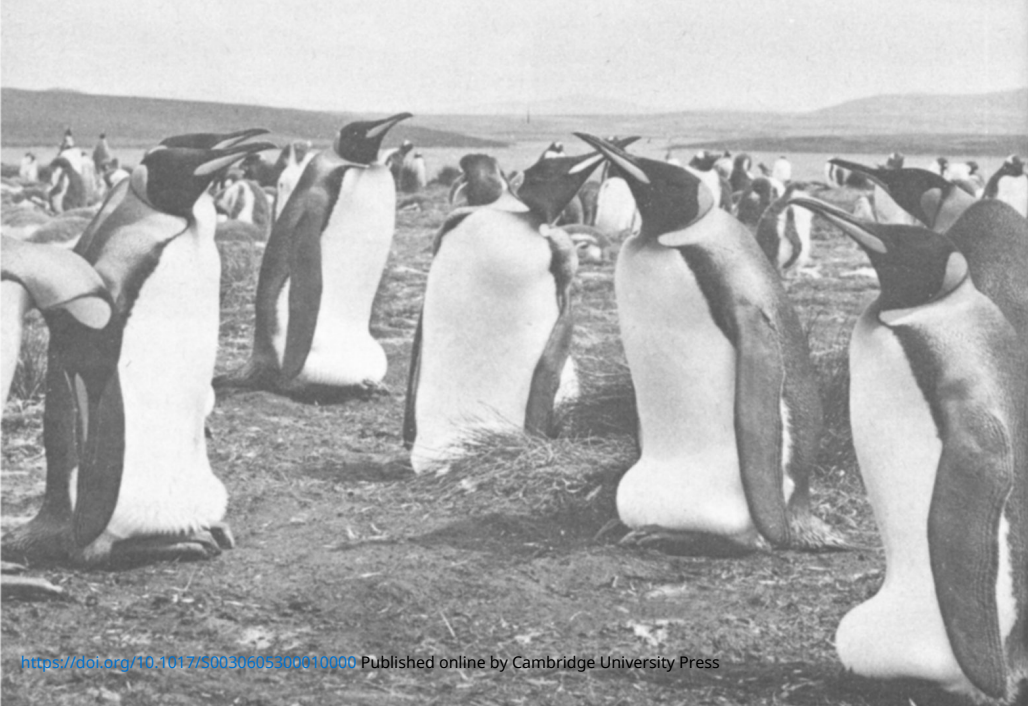
KING PENGUIN COLONY