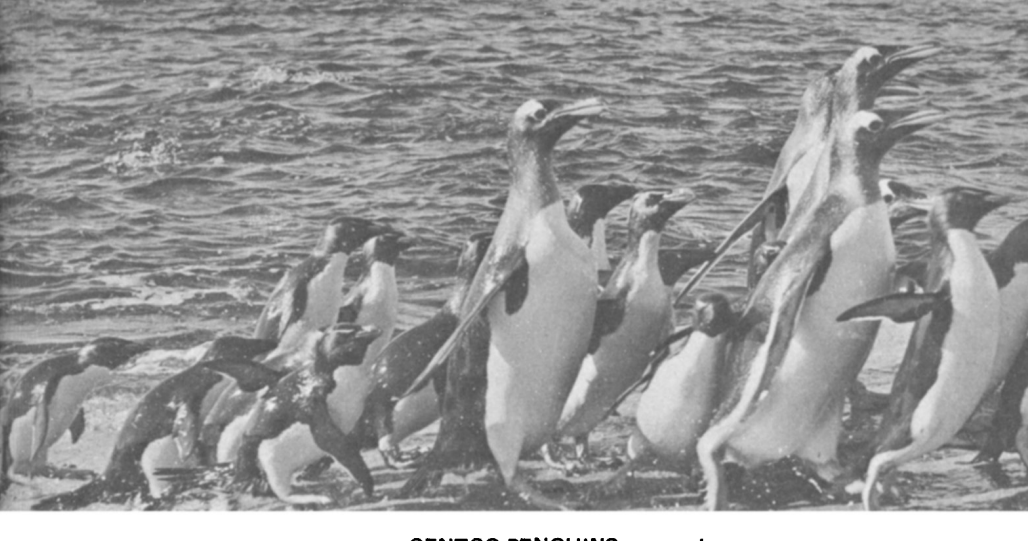
GENTOO PENGUINS come ashore

BEAUCHÊNE ISLAND: A dense throng of black-browed albatrosses and penguins