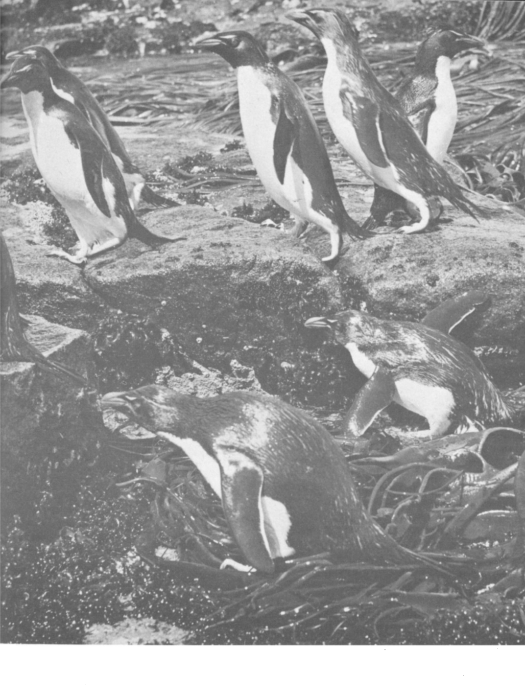
ROCKHOPPER PENGUINS among the kel