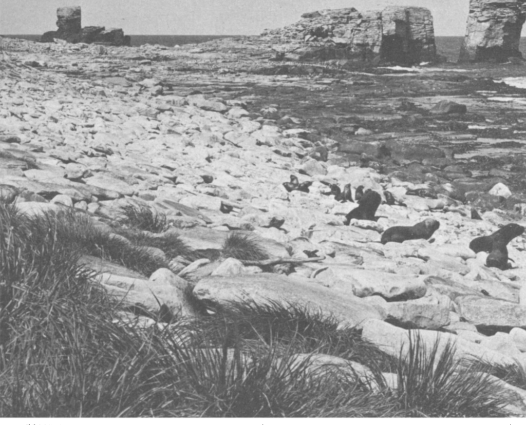
SOUTHERN SEA LIONS, on Beauchene Island, with tussac grass in the foreground.