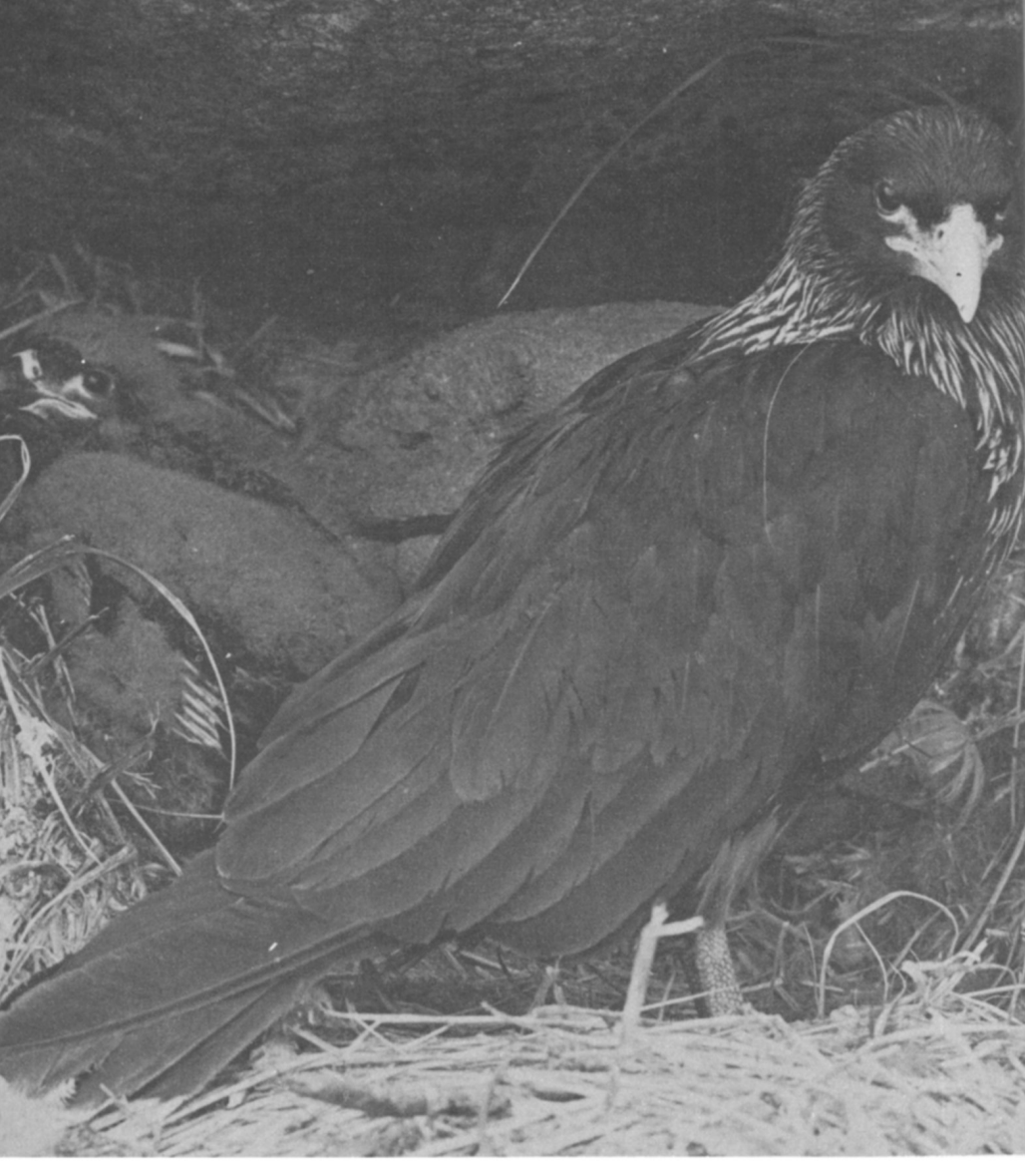
JOHNNY ROOK - the striated caracara - at a nest in the tussac Falklands