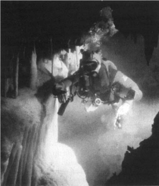
Cave diver in Blue Hole of the Bahamas. Note excellent preservation of submerged speleothems. GB-89-24-1 was found broken on the floor of the cave shown here and removed with the utmost care to preserve the unique underwater environment.

records correlated with ice-core records (see 'The 2000 Radiocarbon Varve/Comparison Issue' of Radiocarbon 43(1)). These new data confirm the fact that radiocarbon ages are consistently younger than the calendar age estimates but there remains a significant amount of scatter in the data.