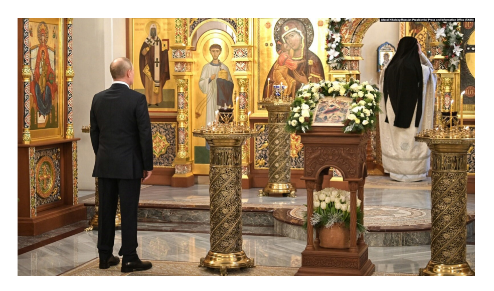
Figure 5. Putin celebrates Christmas alone. 2022.

2018 inaugural prayer service, Christmas photos that show Putin alone with clergy offer a new type of Christmas portraiture that combines his elevated political and spiritual roles to re-sacralize his leadership. Putin's Christmas address underscored partnerships between state and Orthodox Church as