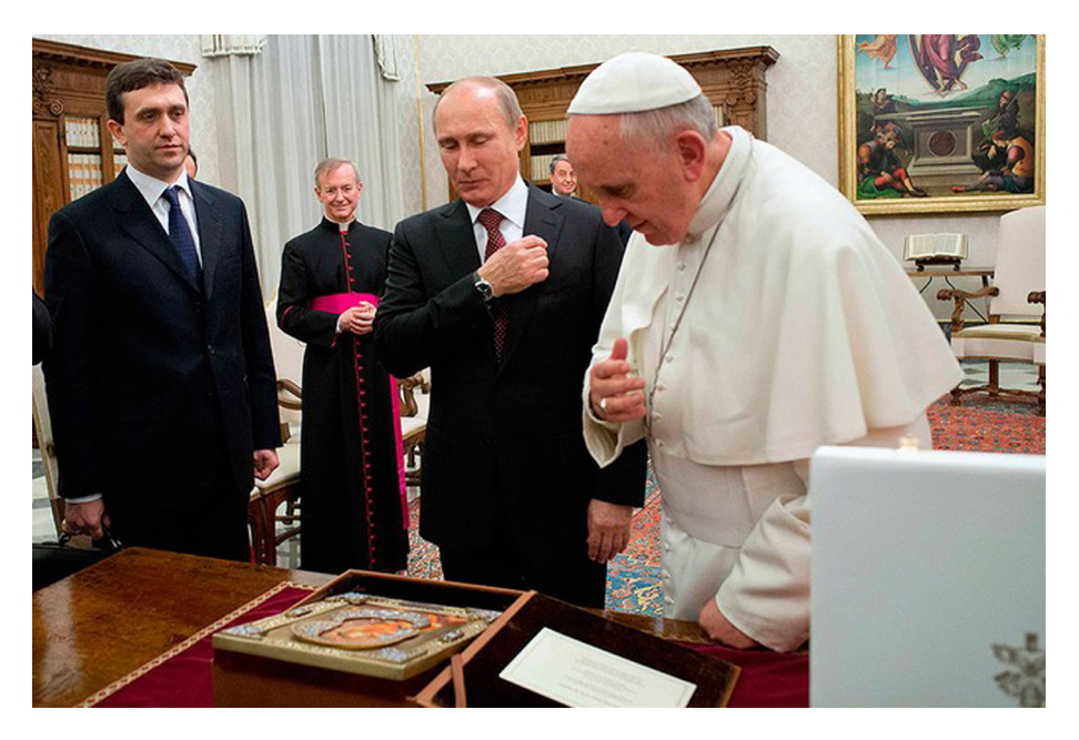
Figure 6. Putin presents Pope with an icon of the Vladimir Mother of God. Vatican. 2013.

was regarded as tacit support for Russia's 2014 annexation. Of note was Berlusconi's participation alongside Putin in rituals of icon veneration in the Cathedral of Saint Vladimir in the National Preserve of Tauric Chersoneses outside of Sevastopol, to which Putin gifted the analogous icon of Saint Vladimir. Berlusconi's presence and role in these activities seemed to ritually and politically validate Putin's perception of Crimea as "sacred" Russian space. Indeed, just months earlier in his address to the National Assembly, Putin—in a clear instance of "cultural semiotic transfer"—had symbolically relocated Jerusalem's Temple Mount to Crimea, where he pinpointed Russia's "spiritual" and political roots: