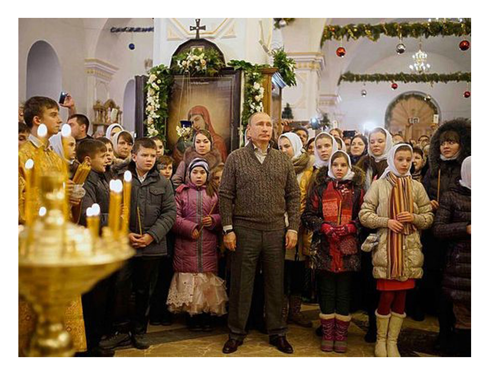
Figure 4. Putin with Donbass refugees. 2015.

2018 inaugural prayer service, Christmas photos that show Putin alone with clergy offer a new type of Christmas portraiture that combines his elevated political and spiritual roles to re-sacralize his leadership. Putin's Christmas address underscored partnerships between state and Orthodox Church as