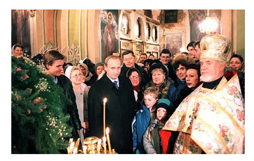
Figure 2. Christmas 2000. Moscow.