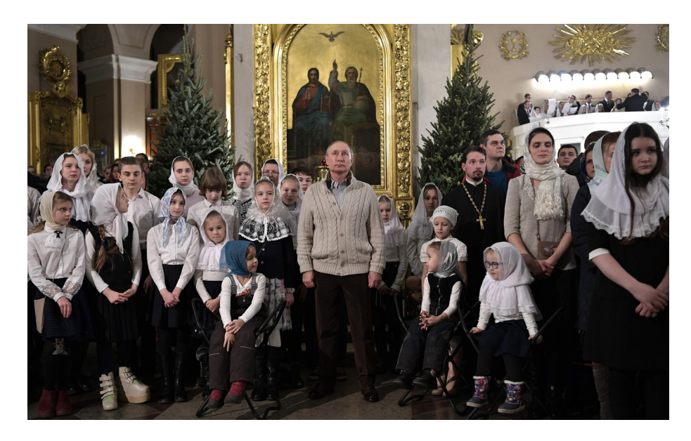
Figure 3. Christmas 2020. St. Petersburg.

political portraiture and icons also introduces the notion of "presence" into Putin's Christmas visits. As Clemena Antonova notes, both imperial portrait and icon act as "container" of the person or divine prototype they represent