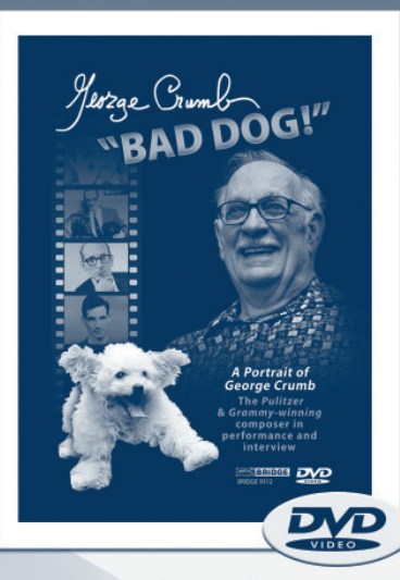
George Crumb: "Bad Dog!" The George Crumb Ensemble "This is a superlative production on every count." –Fanfare BRIDGE 9312