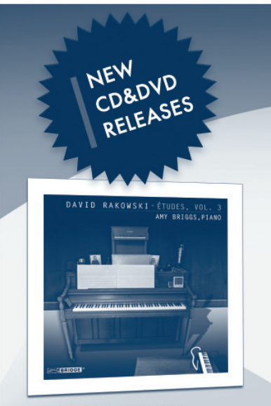
DAVID RAKOWSKI Etudes for Piano, Vol. 3 Amy Briggs, piano BRIDGE 9310