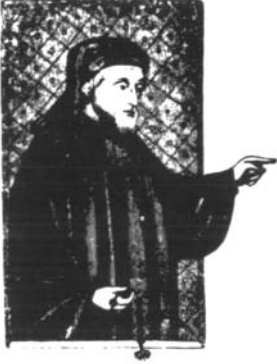
from a limning in OCCLEVE'S POEMS HARL.MSS.4866.