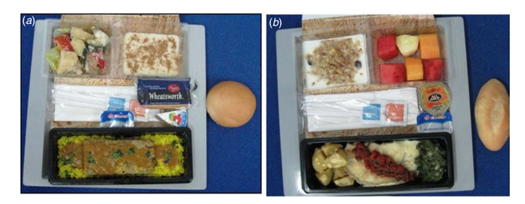
Fig. 2 [colour online]. (a) Evening meal: beef boboti or chicken pasta along with a salad, rolls, butter, cheese, and milk tart. (b) Breakfast: fruit salad, muesli and an egg dish (omelette) with crackers and bread roll.

* For several variables answers were not available for all participants (denominators in percentages may vary).