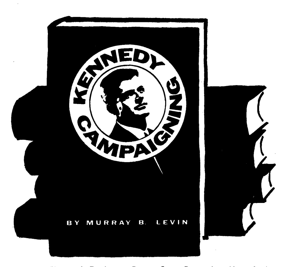
Please mention THE AMERICAN POLITICAL SCIENCE REVIEW when writing to advertisers