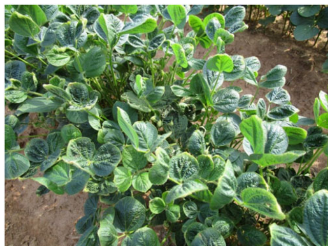
Figure 2. Synthetic auxin symptomology associated with a contamination rate of 5.6 g ae ha -1 dicamba in combination with 656 and 560 g ai ha -1 glufosinate and acifluorfen, respectively, 28 d following a V3 application to soybean in Fayetteville, AR, in 2018.

systemic herbicide such as glufosinate and clethodim or glufosinate and dicamba (Burke et al. 2005; Meyer and Norsworthy 2020), a glufosinate-resistant soybean cultivar will not show contact symptomology of either glufosinate or acifluorfen to the extent that a weed will. When dicamba was applied at the lower rates of 0.056 and 0.56 g ae ha -1 , there was less consistency with the enhanced auxin injury phenotype. Glufosinate mixed with dicamba at 0.056 g ae ha -1 resulted in increased auxin injury at both 21 and 28 DAT, and dicamba at 0.56 g ae ha -1 resulted in increased auxin injury at 28 DAT. When acifluorfen alone or the mixture of acifluorfen and glufosinate were combined with dicamba at 5.6 g ae ha -1 , increased auxin injury was observed, however; this trend was not evident at lower contamination rates of dicamba, similar to what was observed with dicamba contamination of glufosinate (Table 5).