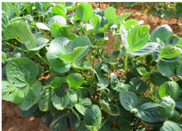
Figure 1. Synthetic auxin symptomology associated with a dicamba application alone at 5.6 g ae ha -1 28 d following a V3 application to soybean in Fayetteville, AR, in 2018.