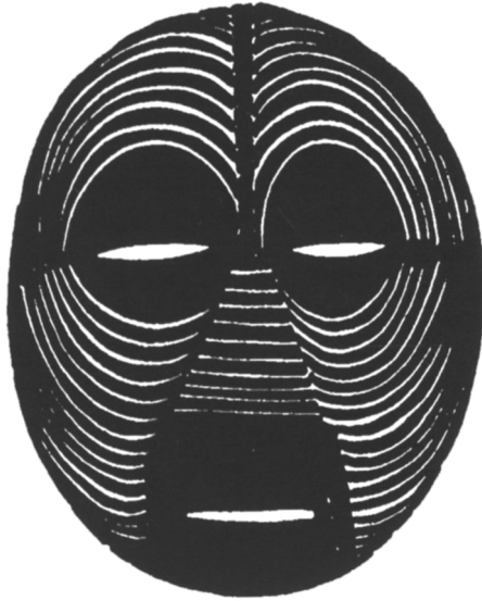
Luba painted wooden and china-clay mask, Zaire.