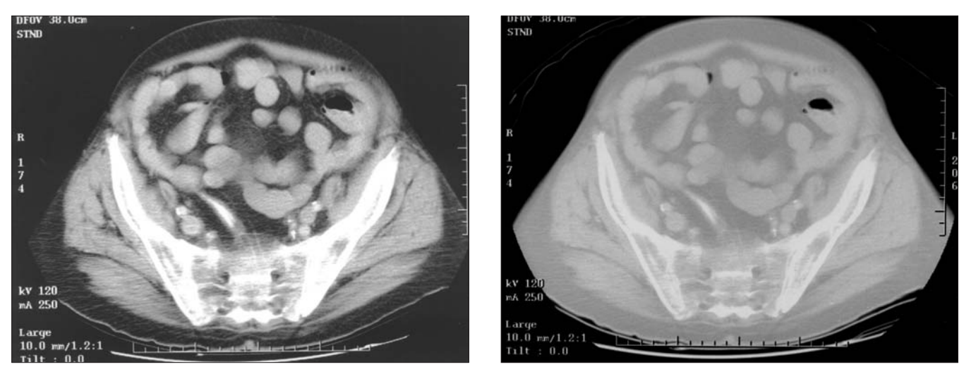
Fig. 4. Intravenous and oral contrast enhanced studies in the same patient 1 month later, demonstrated in soft tissue (A: left) and lung (B: right) windows. There is no further evidence of pneumatosis intestinalis, supporting the initial diagnosis of benign intramural gas.