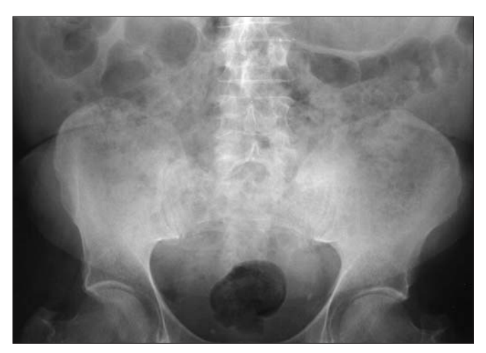
Fig. 2. Plain film abdominal series. Coned pelvis. Discrete loculated air-filled structures originating from the intramural portions of the small and large bowel are noted. The bowel gas distribution pattern is otherwise normal.

When assessing the radiographic appearance of intramural gas, the organization and distribution of the gas is diagnos-