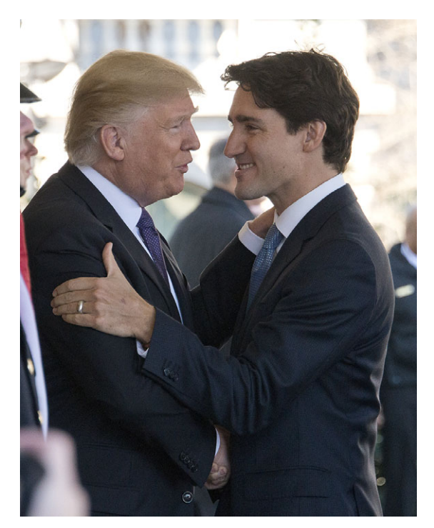
Image 7.2 Handshake between Donald Trump and Justin Trudeau

"My handshake with him, it's not innocent." It was "a moment of truth.... We must show that we will not make small concessions, even symbolic," showing how the act was very deliberate and intended to counter domination.