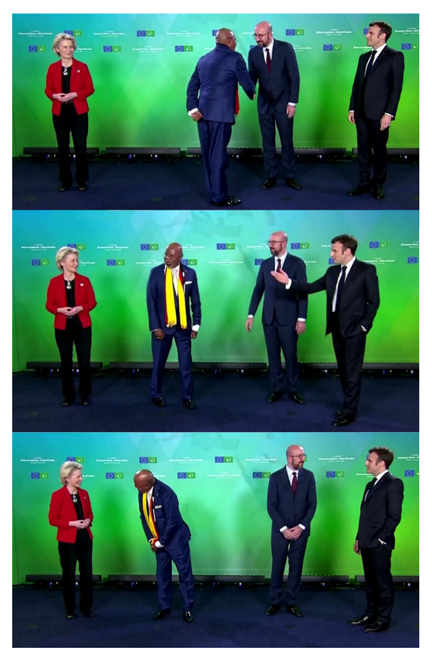
Image 7.6 Ugandan Minister of Foreign Affairs Odongo does not shake Von der Leyen's hand