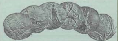
Gold Medal (Highest Award), Allahabad 1910.

GRANDS PRIX : Paris 1900, Brussels 1910, Buenos Aires 1910