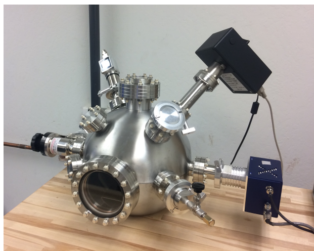
Figures 1 and 2. Moxtek AP3.3 windows and experimental apparatus at XEI Scientific.