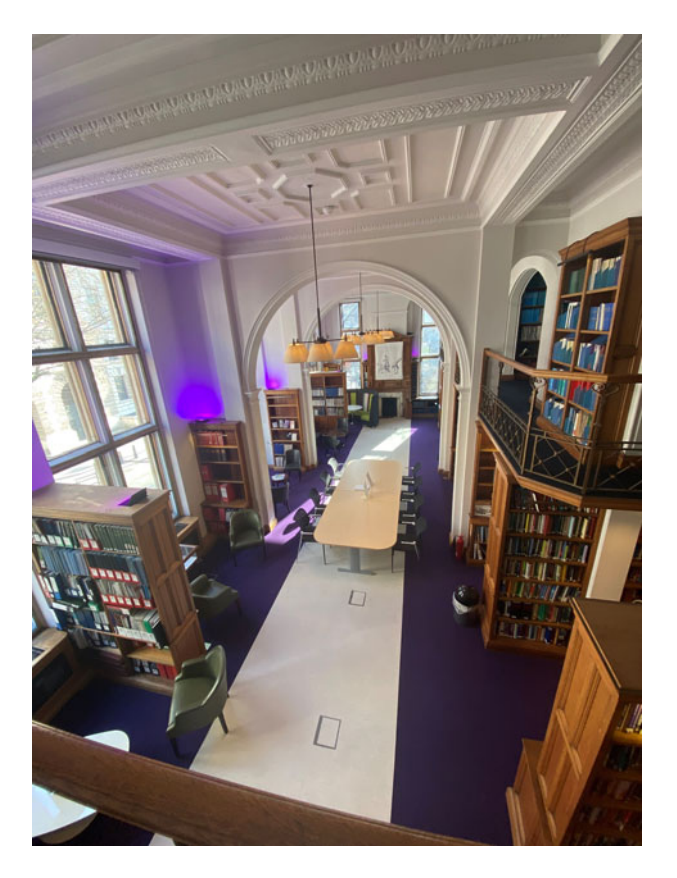
A view of the RICS Library from the gallery – note that you will only be able to see the on-brand purple carpet in LIM on Cambridge core, which is in colour