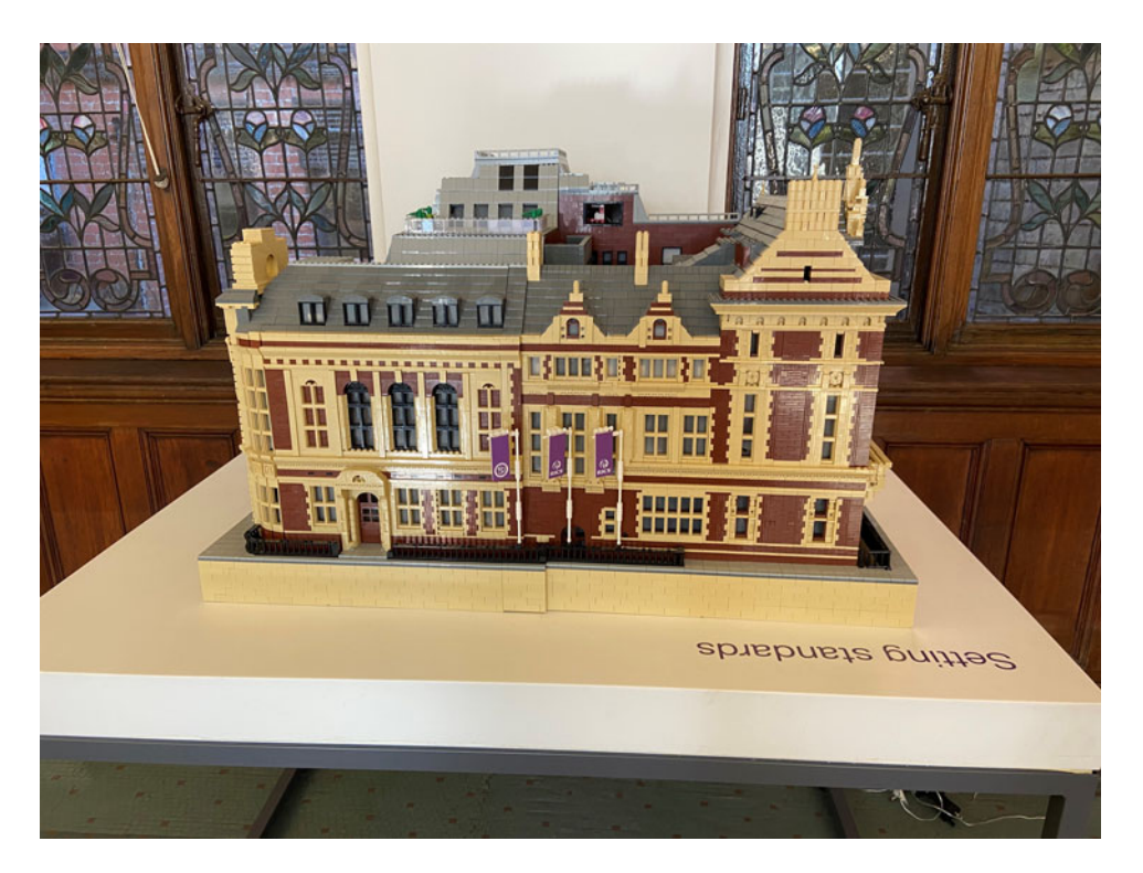
RICS HQ in Lego. While it would have been possible to include a picture of the RICS HQ, this model is always popular with students when they come to visit