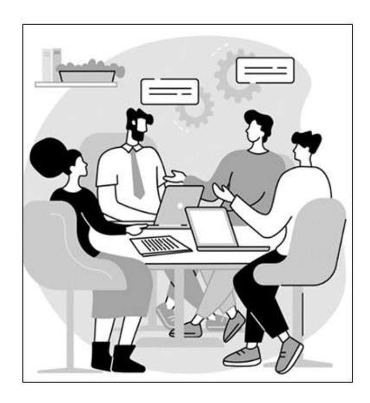
Figure 3. Vignette 2: Sample Team Competency