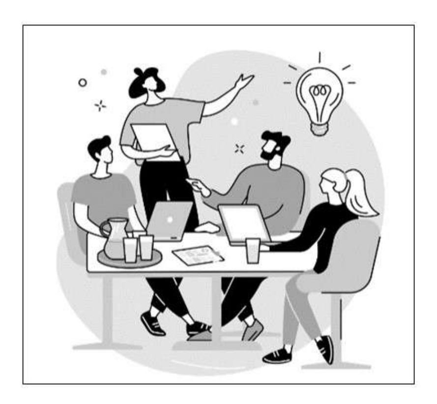
Figure 2. Vignette 1: Sample Individual Competency