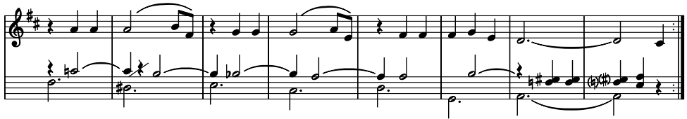
c My reading