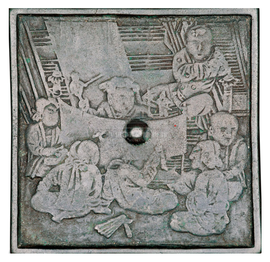
Figure 7. Bronze mirror showing children playing puppet show, Song dynasty (960–1279), 11×11cm. National Museum of China, Beijing.