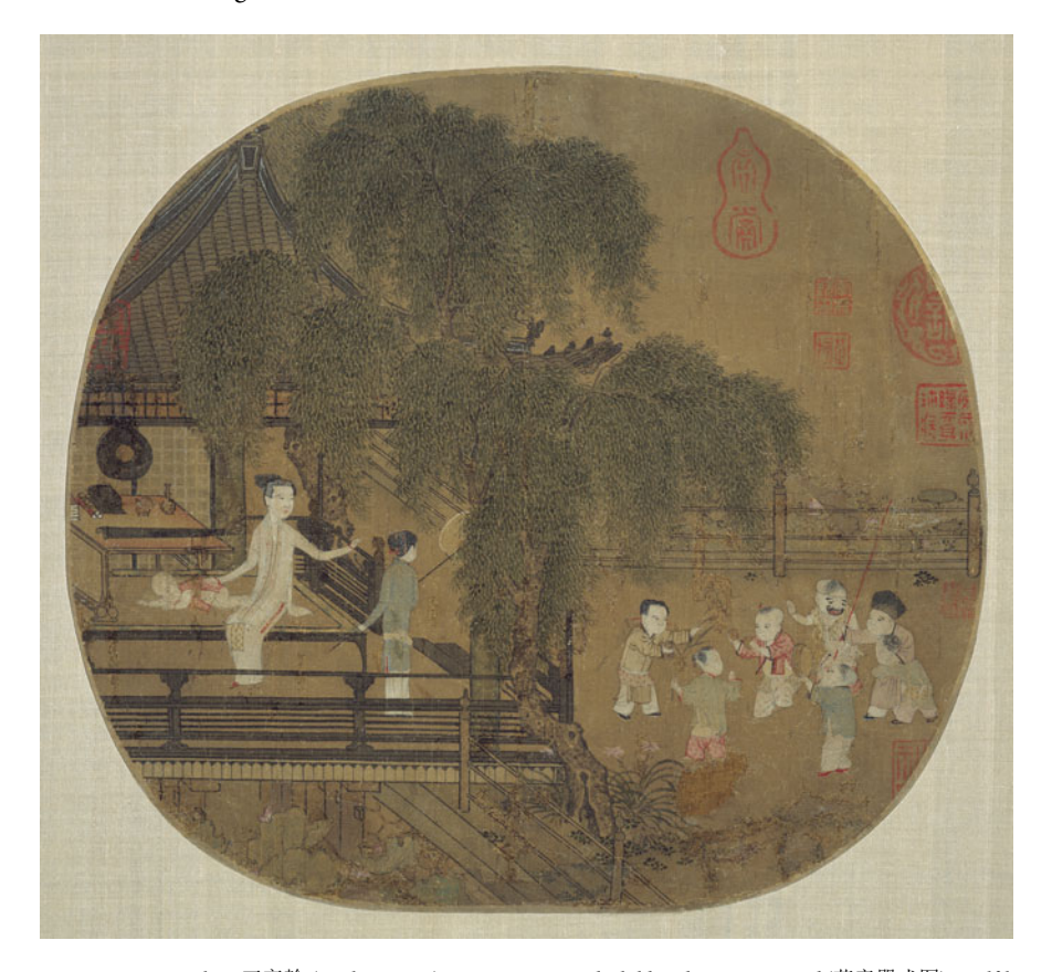
Figure 11. Wang Qihan 王齊翰 (tenth century), attr., Women and Children by a Lotus Pond (荷亭嬰戏图), twelfth-thirteenth century, fan painting mounted as album leaf. Ink and color on silk. 23.9 × 25.8 cm. Accession number: 28.842a. Museum of Fine Arts, Boston.

would not attain any goals in the end.<sup>43</sup> To convey this point, Lü borrowed a phrase from Mencius: yamiao zhuzhang 揠苗助長 (to help seedlings grow faster by pulling them up). The implication is that one should not hamper the natural course of development by the application of excessive force.<sup>44</sup>