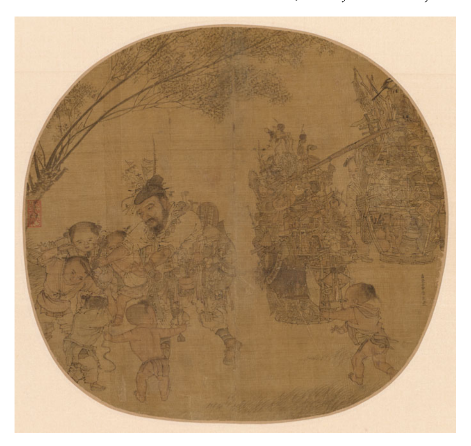
Figure 4. Li Song 李嵩 (ca. 1190-ca. 1230), The Knickknack Peddler (貨郎圖), 1212, Fan mounted as album leaf, ink and color on silk, 24.1 x 26 cm. Accession number: 1963.582. Cleveland Museum of Art, Columbus.

forms are obscured due to usage and damage. Nevertheless, we can distinguish little boys with their hair partially or fully shaved, from girls with their hair tied and decorated with ribbons. The hair style of the girl on the left side matches the hair type represented in Pillow in the Form of A Reclining Girl (Figure 8).