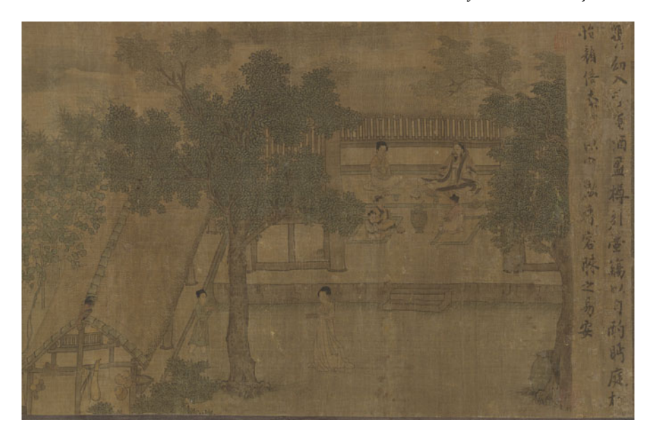
Figure 15. A detail of the third section of Anonymous, Tao Yuanming Returning to Seclusion , twelfth century, Handscroll, ink and light colors on silk. 37 x 521.5cm. National Museum of Asian Art, Washington DC.

One little girl on the left side "holds tightly to the hand of her bare-bottomed baby brother and leans intently toward the drummer." The other girl, seated to the right, holds a puppet joyfully. The passage that this scene illustrates, however, did not mention daughters at all. It is a section from the Classic of Filial Piety (孝經), a standard Confucian text, stating: "The service which a son renders to his parents are as follows. In his general conduct toward them he manifests the utmost reverence. In his nourishing of them, his endeavor is to give them the utmost pleasure." Although the text mentions only the son, Li's painting captured the vivid and playful image of young girls. The girls' active motions suggest that they were equally a center of familial love.