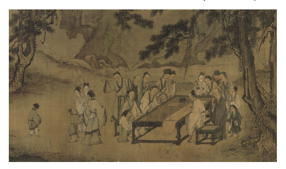
Figure 14. A section from Composing Poetry in a Spring Outing 春遊賦詩圖, attributed to Ma Yuan 馬遠 (1160–1225), twelfth to thirteenth century, Handscroll, ink and light color on silk, 29.5 × 302.3 cm. Accession number: 63–19. Nelson-Atkins Museum of Art, Kansas.

and write. Some homes even sent their daughters to schools run by their friends' families. 66