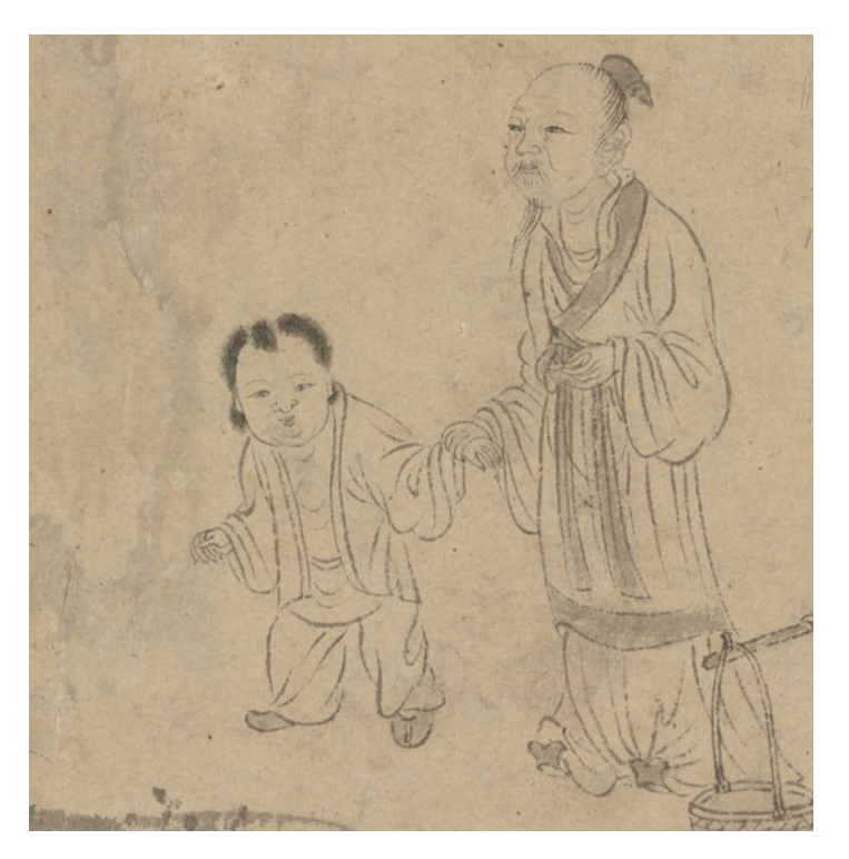
Figure 18. A detail of Illustrations of "Seventh Month" from the Odes of Bin , showing the father holding the little girl's hand.