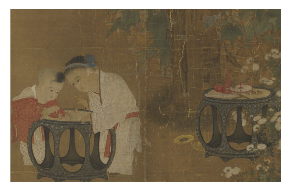
Figure 2. A detail from Su Hanchen, Children Playing in an Autumn Garden.

pearls dangling from her hairband are a metonymy for the preciousness that she represents. This scene appears to contradict a conventional view of girls and women in imperial China, which largely characterized them as being suppressed and obedient in family and society.<sup>20</sup> In the painting, however, the girl is taking a more active role, interacting with the boy in the game.