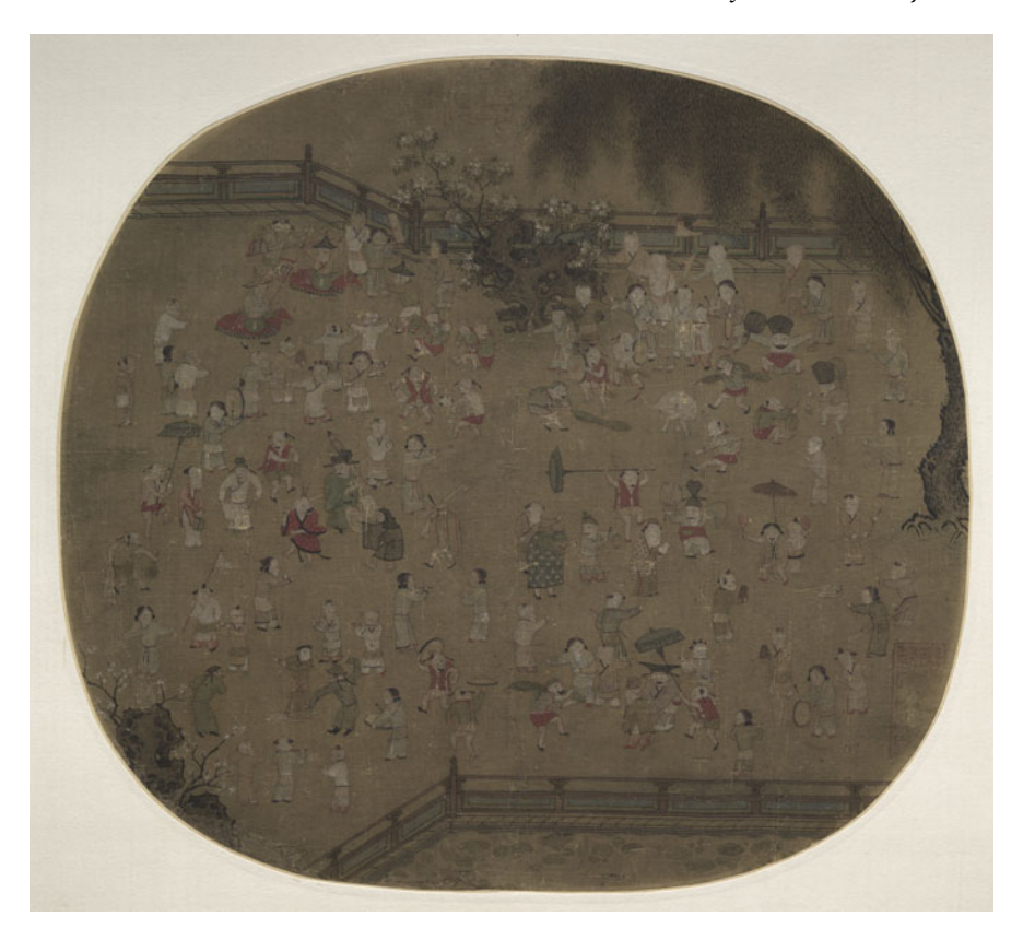
Figure 9. Attributed to Wang Juzheng 王居正 (active twelfth century), One Hundred Children at Play 百子圖, 1100–1200, fan painting, ink and colors on silk, 28.8 x 31.3 cm. Accession number: 1961.261. Cleveland Museum of Art, Columbus.

One can imagine the gleeful moment when Wen Tong's son and daughter saw the duckweeds they had planted grow so rapidly. We can imagine that Wen's children were gratified by the fruits of their labor.