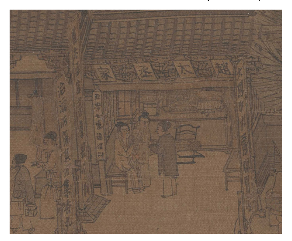
Figure 20. A detail of Spring Festival Along the River, showing a pediatric clinic.