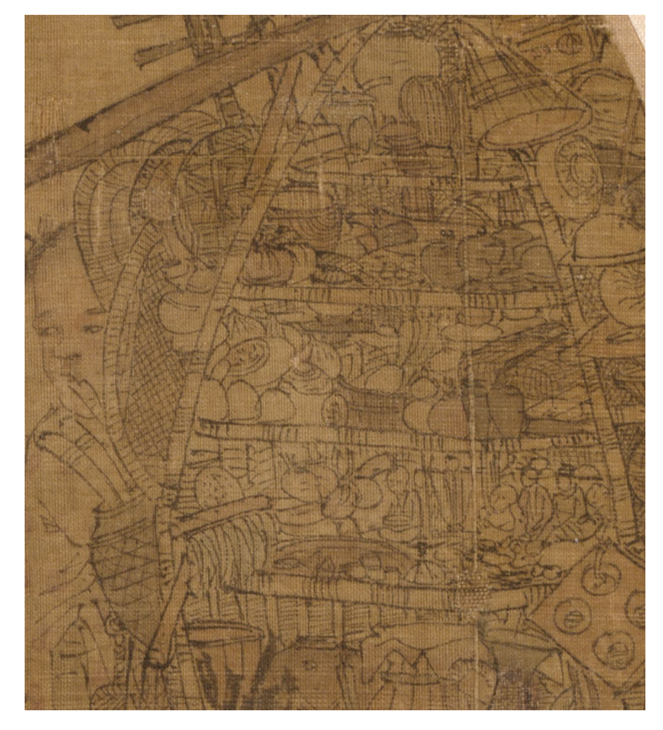
Figure 5. A detail of The Knickknack Peddler showing clay figures among the toys.

girls were also considered precious. Girls with double chignons (and not shaved in the middle) tied in red hairbands are actively engaged in activities. Some are playing flutes, some are playing little drums, and some appear to be supervising play. The artist showed the intimate relationship between sisters and brothers (Figure 10). Some of them hold each other's hands or arms; some perform in a music band. One little boy is holding a toy umbrella for his sister who is playing make-believe. Love between siblings overflows the painted fan.