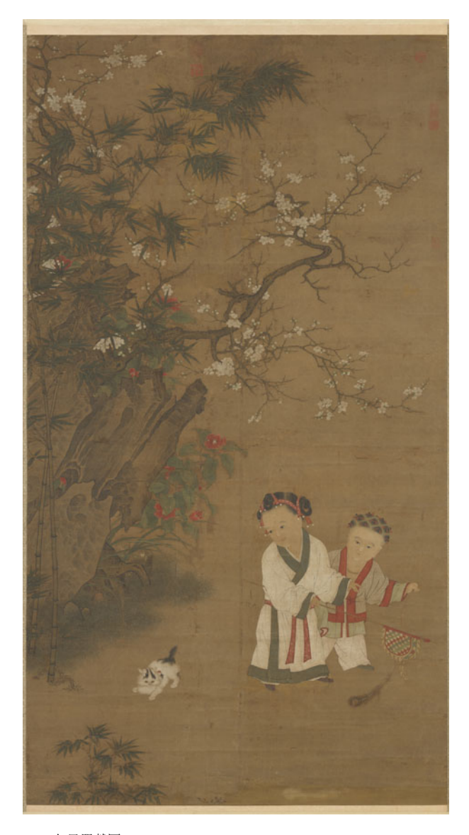
Figure 3. Winter Play (冬日嬰戲圖), Song dynasty (960–1279), Hanging scroll, ink and colors on silk, 196.2 x 107.1 cm. National Palace Museum, Taipei.

If the purpose of such paintings were merely to express an auspicious wish for a fertile family of many sons, <sup>23</sup> why did the artists integrate girls into the scenes and treat them in such detail? That the artists chose to capture touching moments of interaction