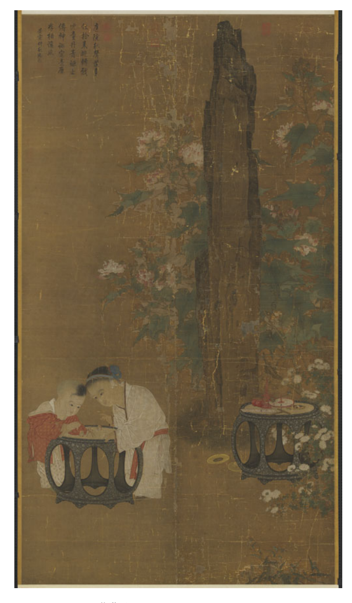
Figure 1. Attributed to Su Hanchen 蘇漢臣 (1094–1172), Children Playing in an Autumn Garden (秋庭嬰戲圖), early twelfth century, Hanging scroll, ink and color on silk, 197.5 x 108.7 cm, Taipei: National Palace Museum

broader social demand for such paintings.<sup>2</sup> Images of children also appeared in narrative paintings, illustrations to classics, as well as on objects such as clay figures and