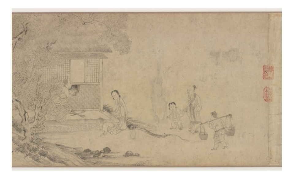
Figure 17. A section of Illustrations of "Seventh Month" from the Odes of Bin 豳风·七月, formerly attributed to Ma Hezhi 馬和之 (active mid- to late twelfth century), mid-thirteenth to mid-fourteenth century, Handscroll, Ink on paper, 28.8 x 436.2 cm. Accession number: F1919.172. National Museum of Asian Art, Washington DC.