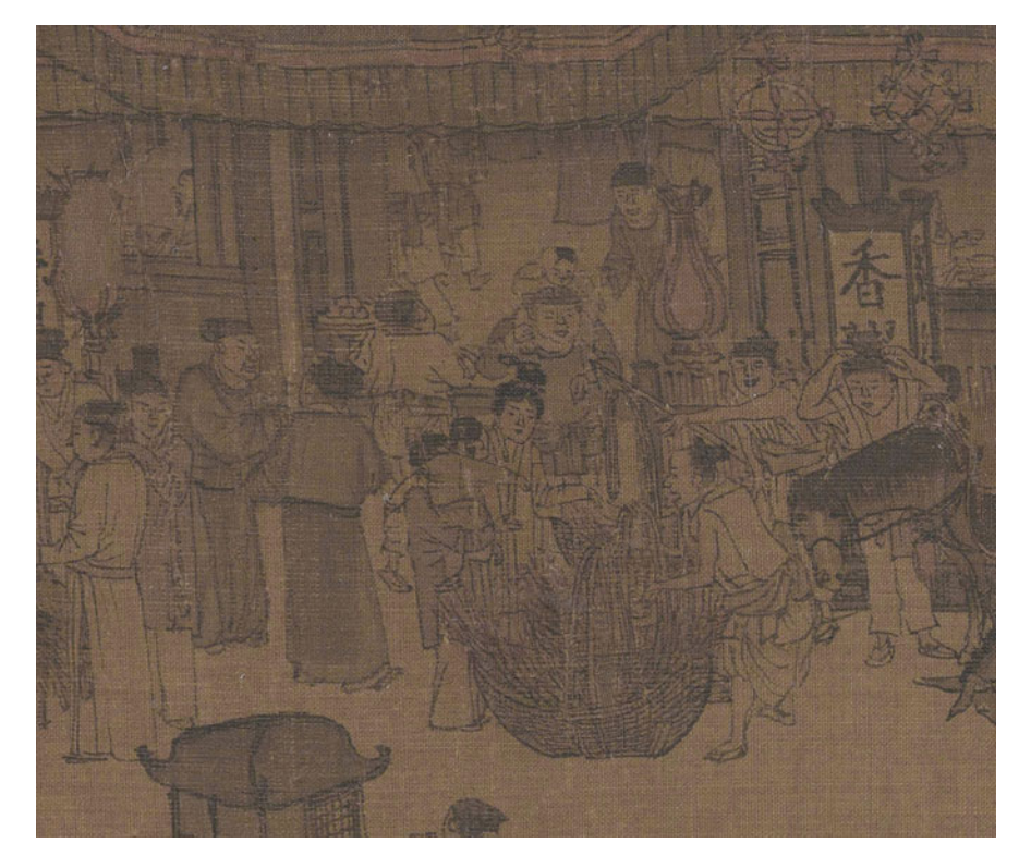
Figure 19. A detail of Zhang Zeduan 張擇端 (ca. 1085–1145), Spring Festival Along the River (清明上河圖), showing a family purchasing flowers, twelfth century, Handscroll, ink and light colors on silk. 24.8 x 528.7cm. Palace Museum, Beijing.

previous night I sewed new clothing; This morning I milled rice. I bought flowers for my young daughter to wear as hairpins; I sent some rice to my poor neighbors" (連夜縫紉辦, 今朝杵臼頻. 買花簪稚女, 送米贈窮鄰).<sup>79</sup> The adoring tone Zhao had for his little daughter manifests through the word zhi 稚, which not only means a young age but captures the vulnerability, innocence, and cuteness of young children. It is remarkable that it was the father who sewed clothes and bought flowers to dress up his little daughter for the New Year.