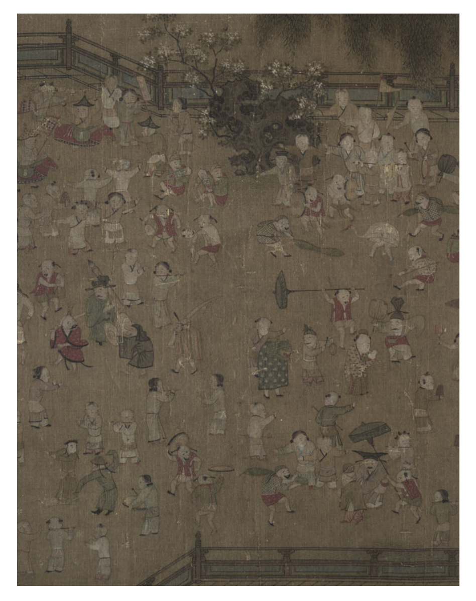
Figure 10. A detail of One Hundred Children at Play, showing girls interacting with boys at play.

sounds and shade while his children ran through the plants grown beside garden paths: