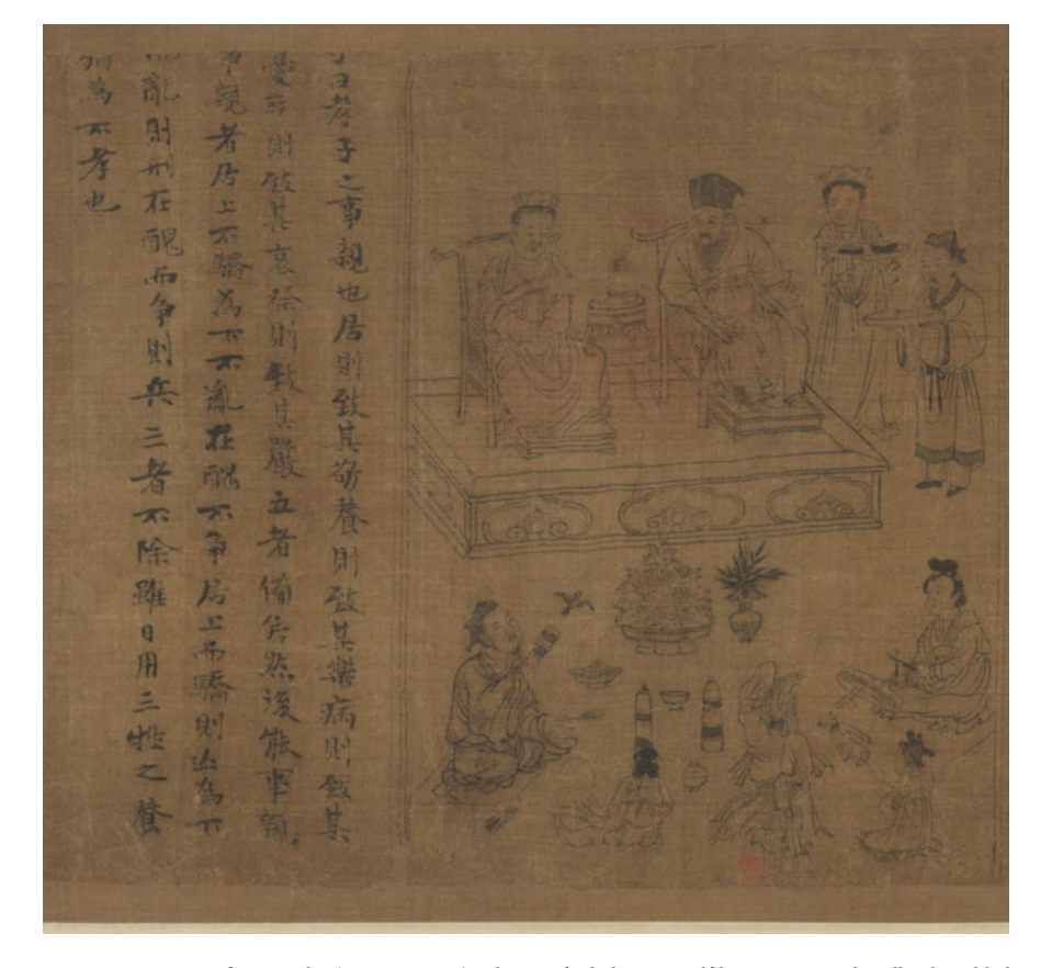
Figure 16. A section of Li Gonglin (ca. 1049–1106), Classics of Filial Piety , twelfth century, Handscroll, ink and light colors on silk. 37 x 521.5cm, Metropolitan Museum of Art, New York.

Woven Silk, the girl in this painting gazes straight into the eyes of viewers, while her father and mother's gazes remain within the picture frame. Her younger brother, still at the crawling age, turns away from the spectators. He appears to be more curious at the repairs going on at their house.