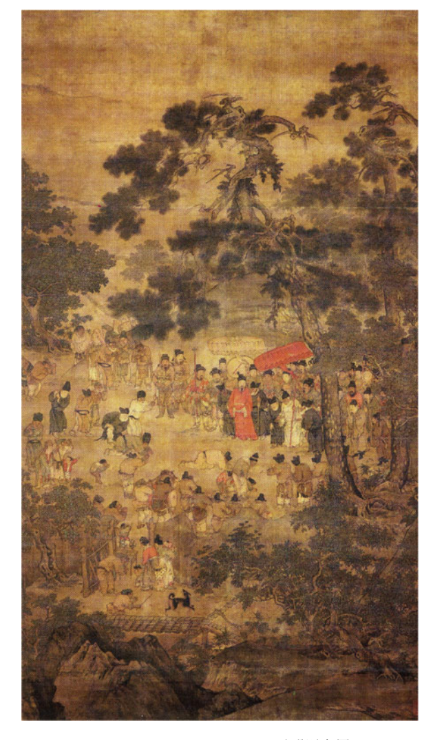
Figure 21. Anonymous, Greeting the Emperor at Wangxian Village (望賢迎駕圖), 1127–1279, Hanging scroll, Ink and color on silk, 195.1x 109.5cm. Shanghai Museum, Shanghai.

Depictions of girls in Song paintings not only reveal how fragile and adorable they are, but also display that each girl has her own temperament. The Southern Song painting Greeting the Emperor at Wangxian Village (Figure 21) depicts a crowd of local villagers welcoming the return of the retired Tang Emperor Xuanzong 唐玄宗 (r. 712–756).<sup>83</sup>