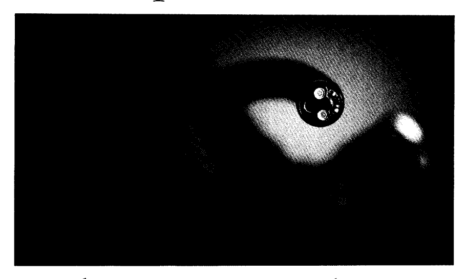
When itcomes to processing endoscopes, the inside is just as important as the outside.

Biopsy channel section after repeated processing in glutaraldehyde.