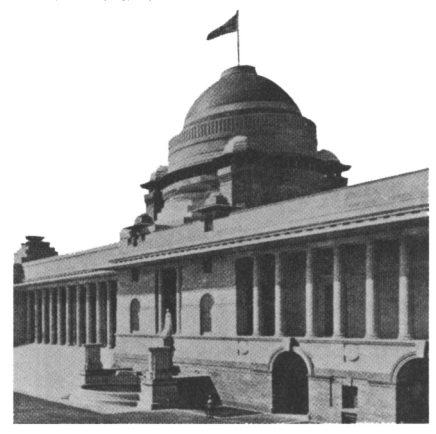
"Sumptuous." — Jan Morris, The (London) Times 180 b/w + 93 color illus. $39:95

The magnificent buildings of New Delhi were designed by Lutyens and Baker as an expression of the British resolve to bring disciplined order to the Indian subcontinent. They convey the very essence of art for empire's sake, yet by the time they were completed the city had become instead a monument to the demise of British authority. This handsome book explores the symbolic meaning of the capital and the dramatic progress of its construction.