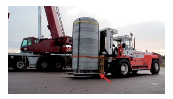
Fig. 3. A fully assembled distance block, the cable block can be seen at the bottom of the component (marked with a red arrow).

All piping and cabling had to be kept within the periphery of the bentonite component as there is only a 42.5 mm annular gap between the rock and the components. Therefore, a cable block made of metal was placed at the bottom of each component that allowed for protection of the cabling during deposition (Fig. 3). The cable block was removed after deposition. As the relative humidity in the