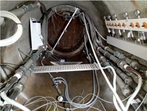
Fig. 4. Left: Installation of the plug, the collar is installed (red arrow) while the cap (blue arrow) is on the floor prepared to be lifted and welded in position. Right: the outside of the test section with the plug in position and all the cabling connected.

The main activities include the development of the installation technique for vertical bentonite buffer including the design, manufacturing and testing of the machinery; the tools and methods for quality control of the buffer; and the necessary tools for problem handling in case of unexpected problems during the buffer installation.