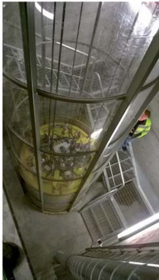
Fig. 5. Left image: the buffer installation machine in the test hall during the lifting test. Testing is done with a concrete block. Right image: the vertical deposition hole, a concrete test block is being lowered to the bottom.