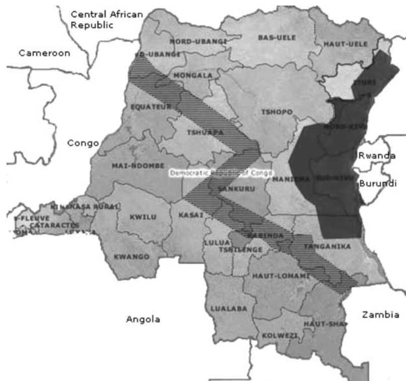
Fig. 1 Map of Democratic Republic of Congo, showing geographical priorities of the European Commission Humanitarian Office 4 . ■, unstable regions still suffering from conflict or emerging from recent conflict – Ituri and Grand Kivu ('red zone'); ▨, regions where intense fighting took place between 1998 and 2001, and which began to stabilise in 2002 – Equateur, Kasai and Katanga ('blue zone')

The experts visited 12 out of 19 health projects. Data from hospitals showed that, in DRC, malaria is the main contributor to the mortality rate and is responsible for about half of childhood deaths (52% in 2003); acute respiratory tract infections, diarrhoea