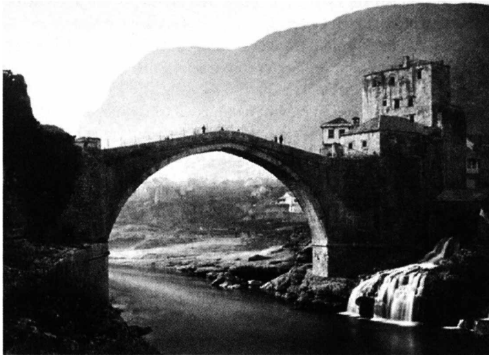
Figure 2 The Old Bridge in 1890 with the Tower Helebija to the right