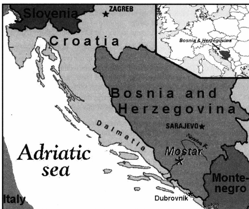
Figure 1 Mostar in Bosnia and Herzegovina

The Neretva River runs through the town of Mostar, which is the administrative and cultural center of the historical region of Herzegovina, the SE part of Bosnia and Herzegovina (Figure 1). Mostar owes its fame to its magnificent Old Bridge, which was added to UNESCO's World Heritage List in July 2005. (The name Mostar comes from the word “most,” which means “bridge.”)