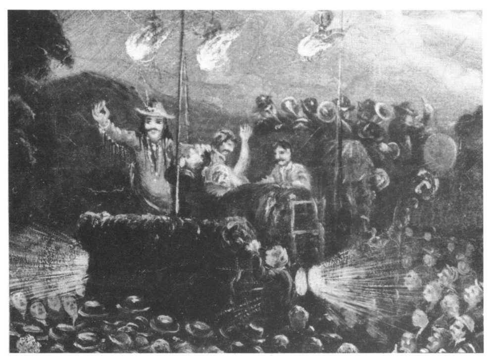
Plate 2 Detail of plate 1: "Sequah on Clapham Common".