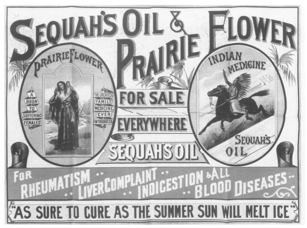
Plate 4 Advertisement for Sequah's medicines. Coloured lithograph, 76.7 \times 101.2 cms. Sequah Archive, Contemporary Medical Archives Centre, Wellcome Institute library, London.