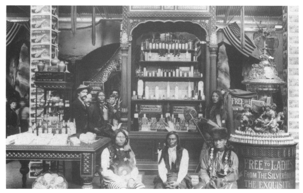
Plate 5 Photograph of a stand of the Burroughs Wellcome Co. at a Chicago Exhibition, probably in the 1890s, with "Red Indians" (see p. 285).