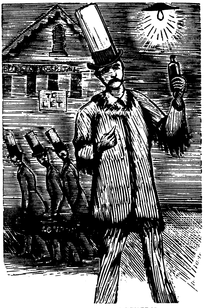
THE NEW SURGEON-GENEBAL.