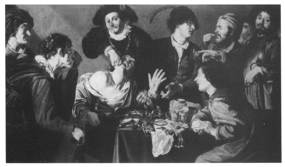
Plate 3 Anonymous oil painting, 17th century, after Theodoor Rombouts, c. 1628, on canvas 110 \times 193 cms. (see p. 316). Wellcome Institute library, London.