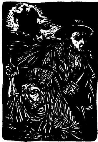
Illustration from LORCA