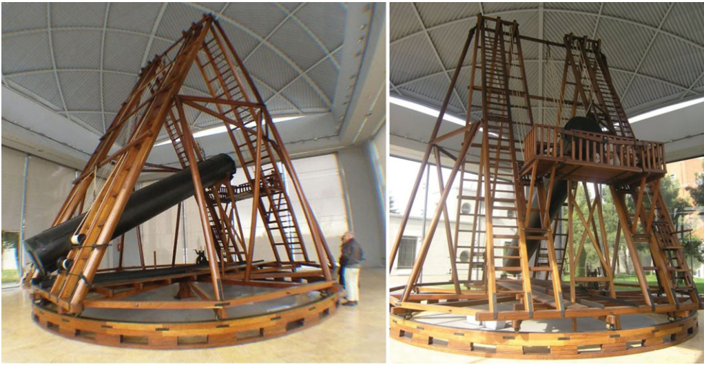
Figure 2. The 25 ft long telescope that the Kingdom of Spain commissioned to W. Herschel by the end of the 18 th century has been full-scale rebuild using the extant notebooks and drawings, and a lot of ingenuity and enthusiasm. What was learned could serve as a guide for any future attempt to rebuild an old, big scientific instrument.

notebooks with detailed information and two sets of large watercolor drawings ordered by José de Mendoza y Ríos, the Spanish naval officer and astronomer who supervised the project in London, were saved from destruction by the observatory director Salvador Jiménez Coronado (cf. López Arroyo 2004).