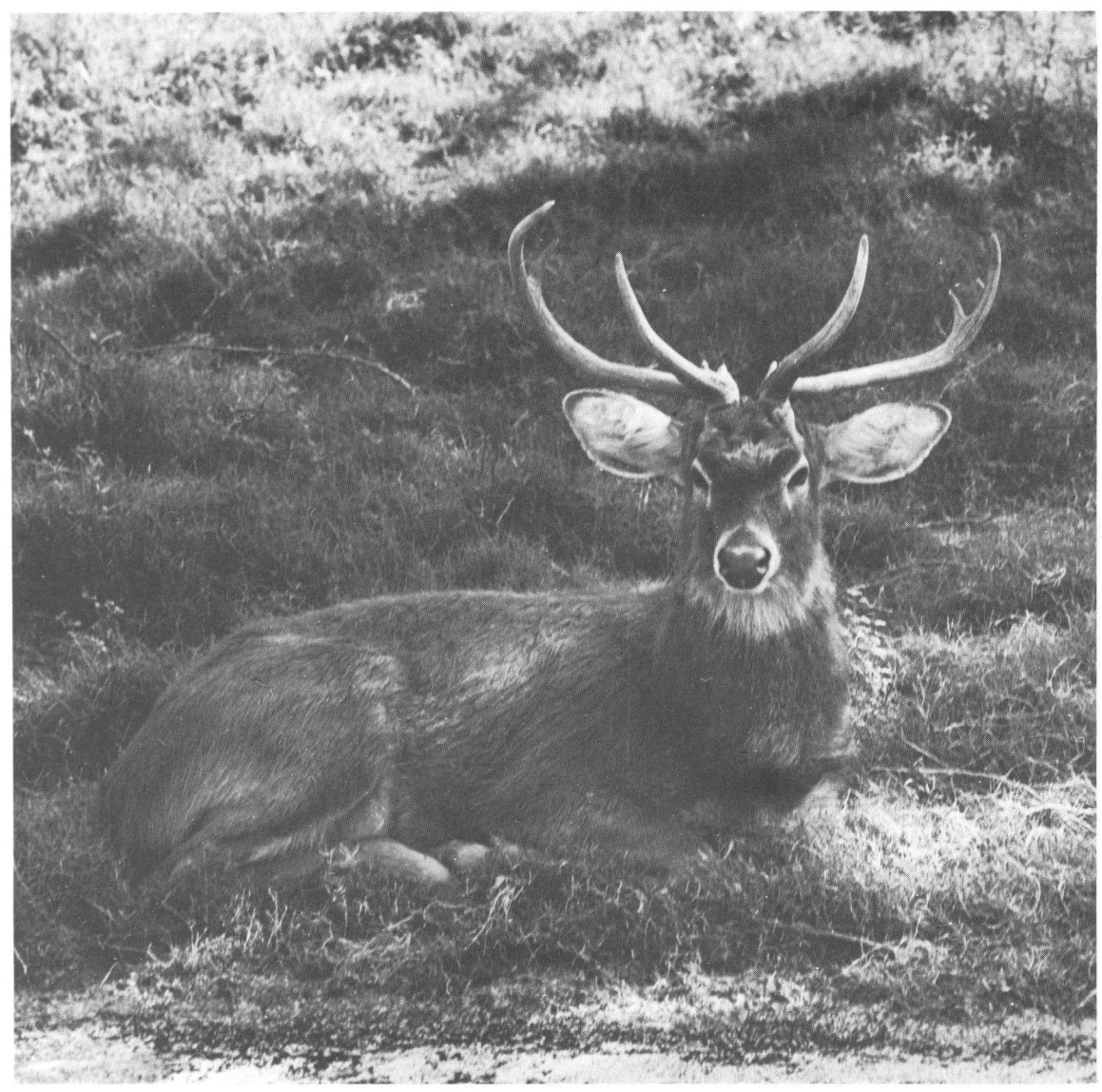
Brow-antlered deer in Delhi Zoo, India.

hence, we are unable to offer a defensible country-wide population estimate. However, we did conduct population surveys in Kyatthin WS as a component of a draft management plan, and the resultant data provide a starting point for assessing population size. The survey was conducted during 30 March—5 April 1983 and consisted of ground-based counts of deer along straight-line transects located at 1.5-km intervals across the southern half of the sanctuary. The Brow-antiered deer in Burma