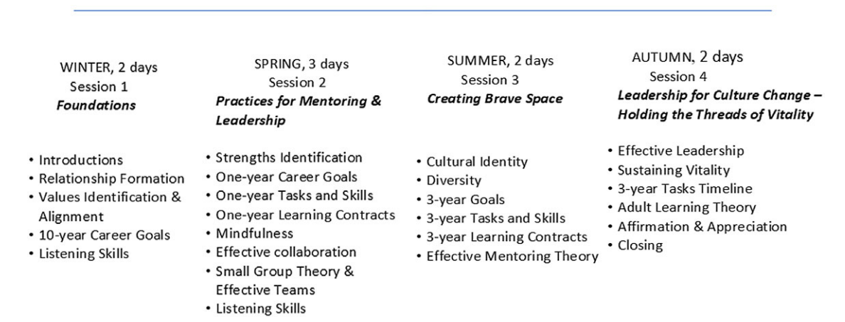
Figure 2. C-Change Mentoring & Leadership Institute curriculum content.

Figure 1. Subject recruitment and inclusion. *The 99 applicants who met the inclusion criteria were stratified into eight groups by underrepresented or non-underrepresented in medicine, male or female, and degree (MD or MD/PhD versus PhD), randomly ordered within each group, and then assigned to the initial intervention (treatment) or waitlist control (delayed intervention). Those remaining in each group were used as ordered replacements if an invited applicant from the group withdrew.