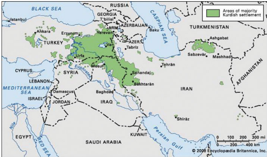
Figure 1. Distribution of Kurds in the Middle East, www.britannica.com/topic/Kurd/images-videos/Areas-of-Kurdish-settlement-in-Southwest-Asia/6304

between Iran, Turkey, Iraq, and Syria (Figure 1), including Turkey to the north, Armenia to the northeast, Iraq to the south, and Iran to the east. Even so, Kurdistan as an entity has appeared on some maps since the sixteenth century (McDowall, 2000).