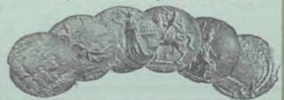
Gold Medal (Highest Award), Allahabad 1910.

GRANDS PRIX: Paris 1900, Brussels 1910, Buenos Aires 1910