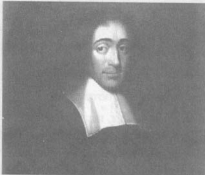
Portrait of Spinoza. Herzog August Bibliothek, Wolfenbüttel; Gemäldesammlung B 117.