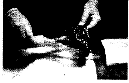
When ready to use, Contain-OR is easily positioned at the connector, the shrink wrap is removed and the sleeve is advanced to the chest tube exit site.