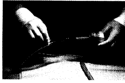
The Contain-OR hub slides over the 3/8" or 1/2" drain tube during system assembly. It will not impede normal chest tube care.

sleeve with a drawtape closure enclosed in a 2" soft plastic, shell-like hub. An easily removed shrink wrap covers the sleeve until ready to use .