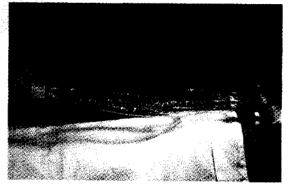
While anchoring the airtight dressing and drawtape with one hand, the tubes are removed briskly into the sleeve and the drawtape is closed in one continuous motion.