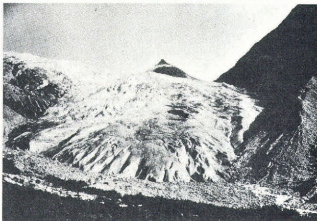
Fig.1(a) Illecillewaet Glacier 1899 (Vaux 1909).

In 1945, the Dominion Water and Power Bureau, forerunner of the WSC, decided to include the Illecillewaet Glacier in its annual snout and surface movement surveys.