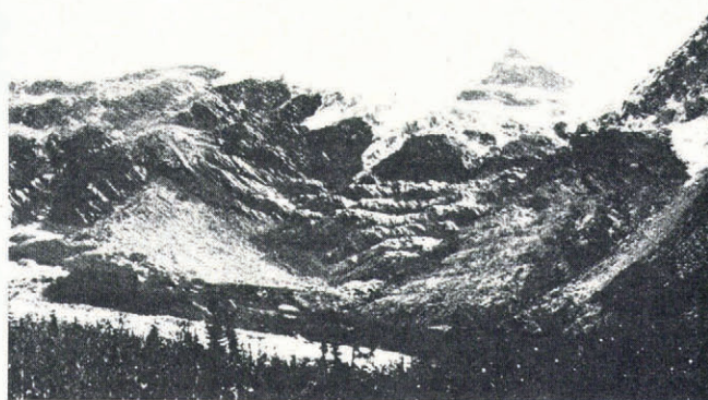
Fig.1(b) Illecillewaet Glacier 1931 (Wheeler 1932).