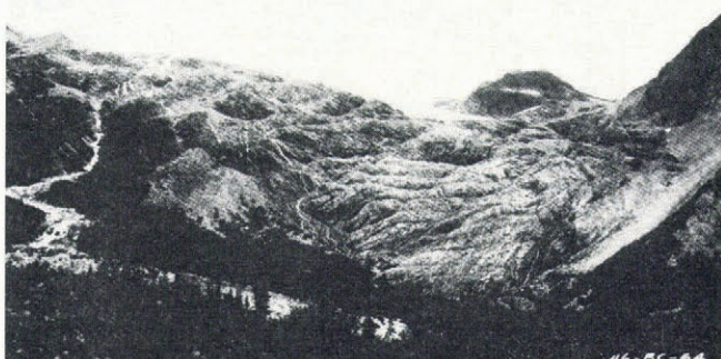
Fig.1(c) Illecillewaet Glacier 1946 (C.E. Webb unpublished report).