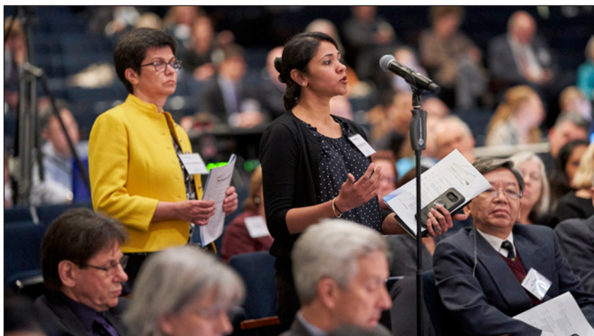
Audience members ask questions during The Endless Frontier: The Next 75 Years in Science Symposium at the National Academy of Sciences, February 26, 2020.