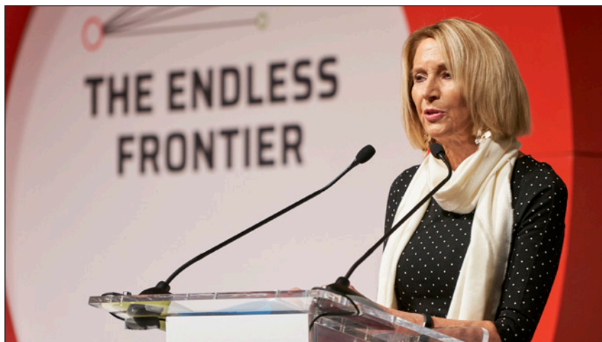
Marcia McNutt, president of the US National Academy of Sciences and co-sponsor of the Endless Frontier symposium “The Endless Frontier: The Next 75 Years in Science,” with The Kavli Foundation and the Alfred P. Sloan Foundation in Washington, DC, on February 26, 2020, gives the opening address.

In the next 75 years, panelists said US R&D policy needs to balance the risks of national and economic threats with the necessity of international openness. Sharing information globally has particularly shown its importance during the novel coronavirus COVID-19 pandemic. Materials researcher Robert Langer, who is the David H. Koch Institute Professor at the Massachusetts Institute of Technology, has benefited from open data in his work on developing a vaccine for the virus. According to the timeline given by a company Langer co-founded, Moderna, Inc., researchers in China uploaded the genetic sequence of the novel coronavirus to a public database on January 11, 2020, and within two days, the research team at Moderna, together with the National Institutes of Health (NIH), finalized the sequence for mRNA-1273, which is now the basis for the company’s lipid nanoparticle-based vaccine. The mRNA is taken to immune cells where it instructs cells to synthesize the spike protein as if they have been infected by COVID-19. By