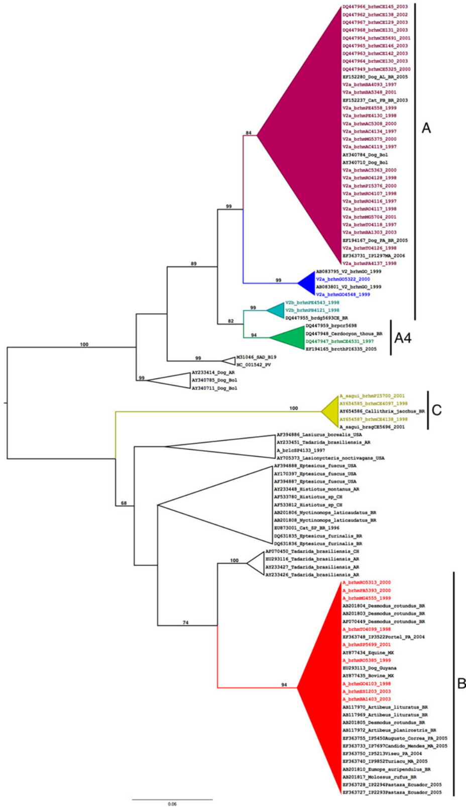
Fig. 2 [colour online]. Phylogenetic tree with samples from Brazil and the Americas reconstructed by maximum likelihood using the GARLi program. Bootstrap values were obtained from 1000 resamplings. Only bootstrap values >60% are shown at the branching points. The phylogenetic groups A, B, C and A4 previously observed are maintained after this analysis.