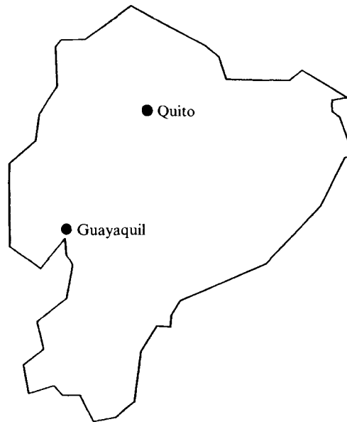
Fig. 1. Map of Ecuador with location of Guayaquil and Quito, the capital, indicated.