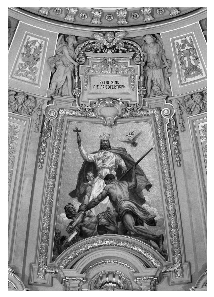
Figure 1.1 "Blessed are the peacemakers," one of eight mosaics in the Berlin Cathedral depicting the beatitudes from Jesus's Sermon on the Mount. This image, designed and created in the midst of German war and genocide in colonial Southwest and East Africa, depicts a familiar inversion: white Christians portrayed as the victim and peacemaker, a Black man as the aggressor.