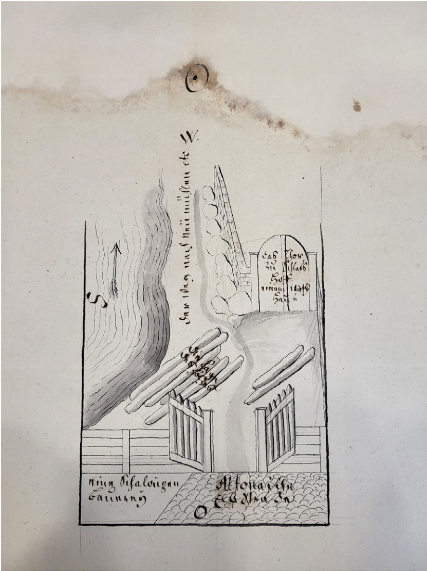
Figure 1. Sketch by police director Johann Peter Willebrand displaying the ideal placement of timber on Elbstraße.