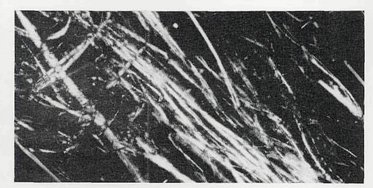
Figure 1: Talc Fibers and Ribbons

chrysotile asbestos, which often occurs in stratigraphic horizons proximal to the talc where it is being mined. Examination of the fibers by polarized light microscopy (PLM) revealed that they were neither, but rather were talc fibers and ribbons (Figure 1). The client was relieved that there was no contaminant and, with this knowledge, modified their screening process to eliminate clogging problems. On one occasion, another talc beneficiator needed to identify black contaminant particles which they could not remove by magnetic separation. PLM analysis quickly identified the particles as graphite. The client was then able to effectively remove the undesired impurity by density separation.