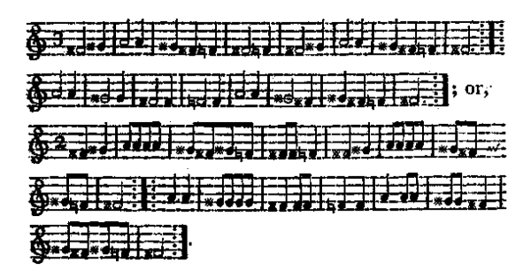
Figure 3 Examples of melodies for the nose flute, composed by Joshua Steele, in 'Remarks on a Larger System of Reed Pipes from the Isle of Amsterdam , with Some Observations on the Nose Flute of Otaheite', Philosophical Transactions 65 (1775),

the Royal Society in 1775.<sup>42</sup> In his articles he sought to clarify the tuning system of two sets of panpipes and the Tahitian nose flute, going so far as to compose two melodies for the latter instrument (Figure 3). As this instrument could produce only four notes, however, it was limited in its adaptation to European musical phrase structure, and the 'general cast' of the melodies was 'melancholy'.<sup>43</sup> This instrument was undoubtedly the same as that seen and heard by Bougainville whilst it accompanied an 'Anacreontic song', and the one later drawn by Sydney Parkinson (see Figure 4).