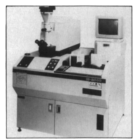
Patterned Wafer Inspection System